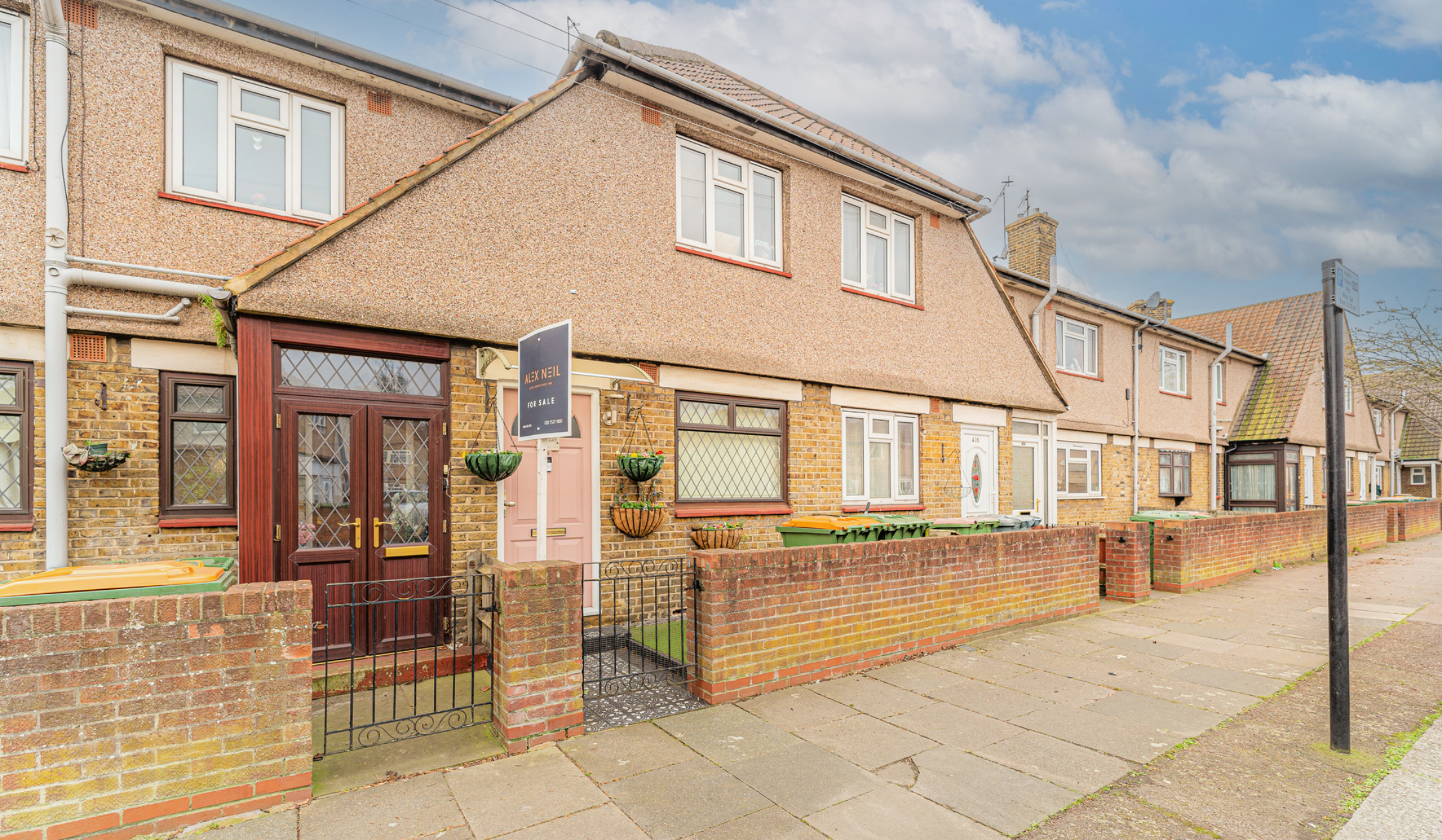
LONSDALE AVENUE E6 3 bedroom maisonette