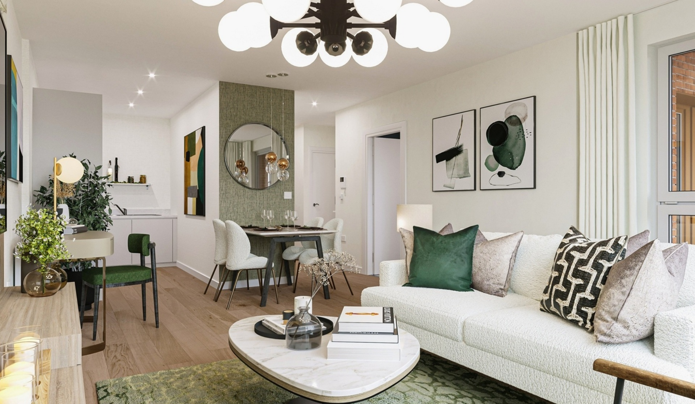
BERMONDSEY HEIGHTS SE15 2 bedroom apartment