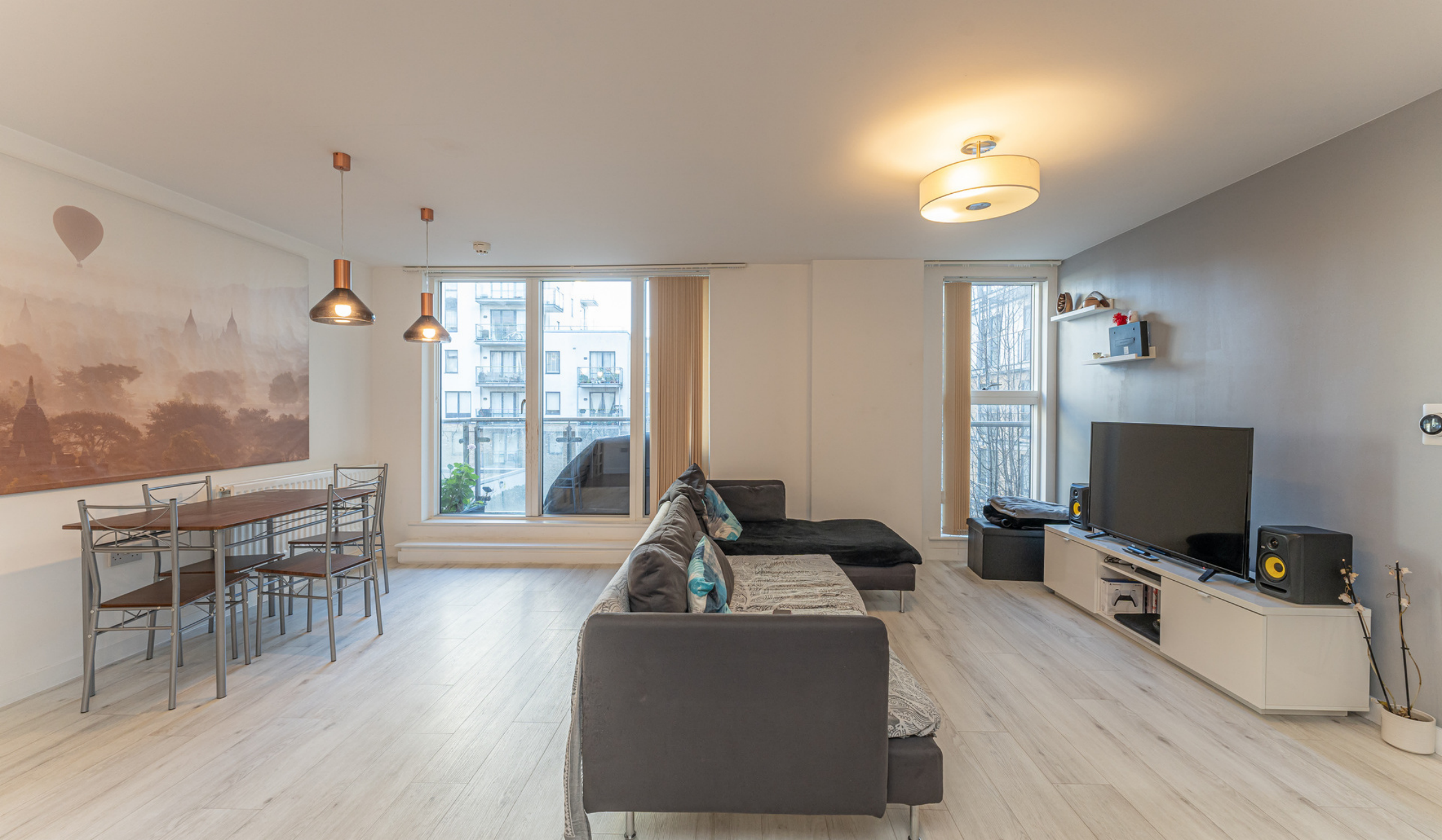
MAESTRO APARTMENTS E3 2 bedroom apartment