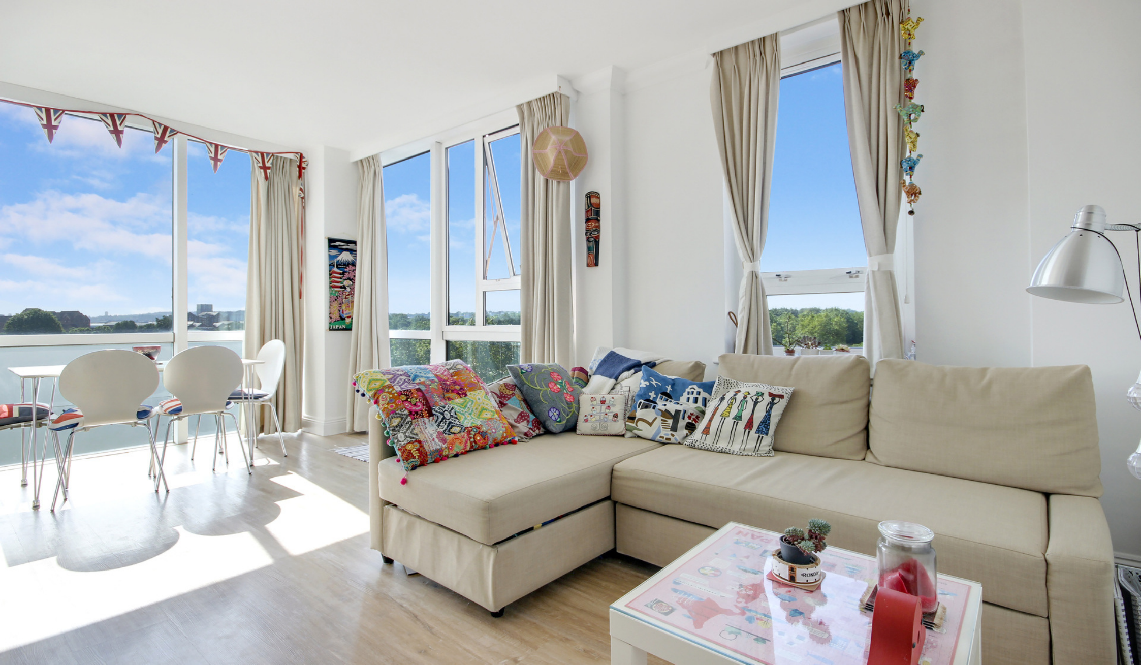
AEGON HOUSE E14 1 bedroom apartment