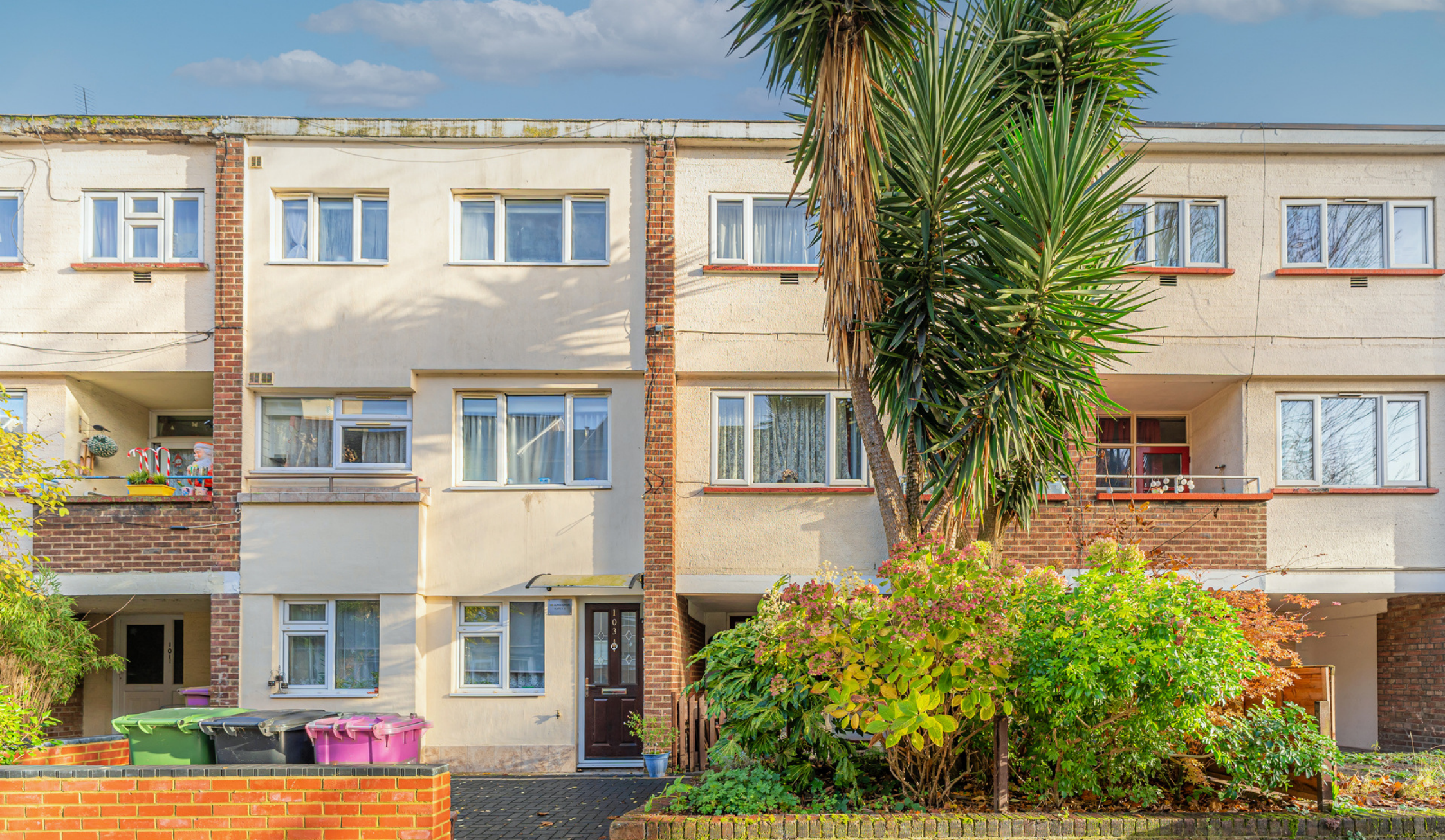
ALPHA GROVE E14 3 bedroom terraced house