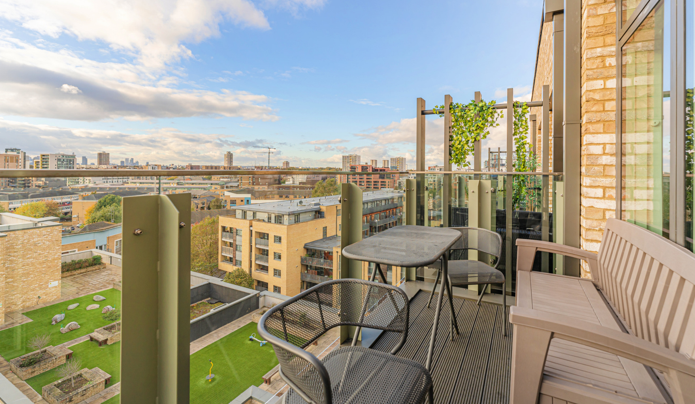
CHORLEY COURT E14 1 bedroom apartment