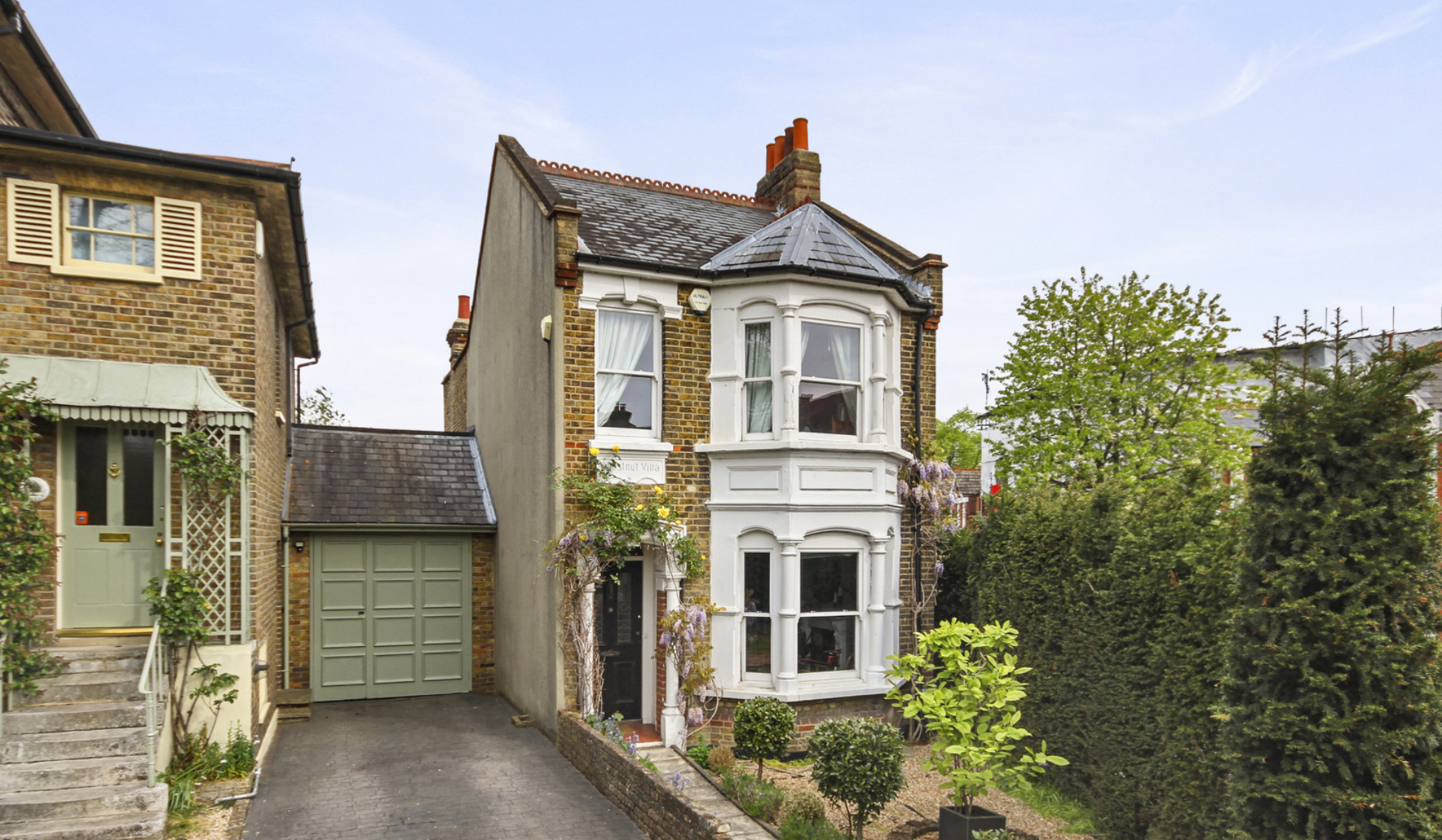
GREEN LANE BR7 3 bedroom link detached house