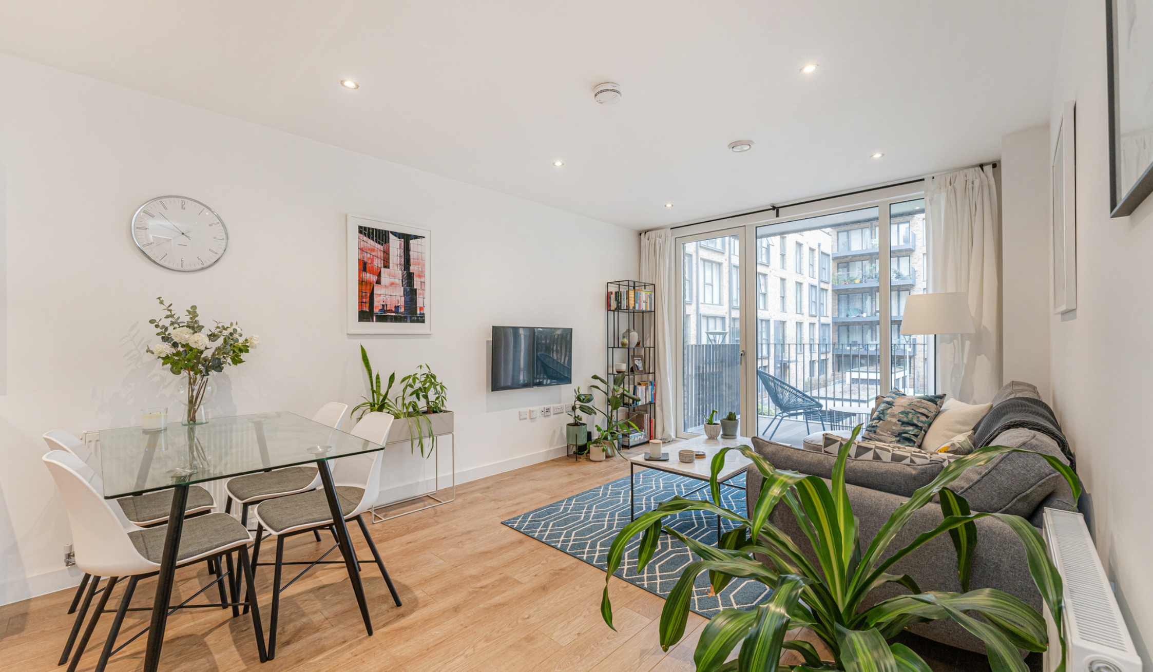
ASHLEY COURT E3 1 bedroom apartment