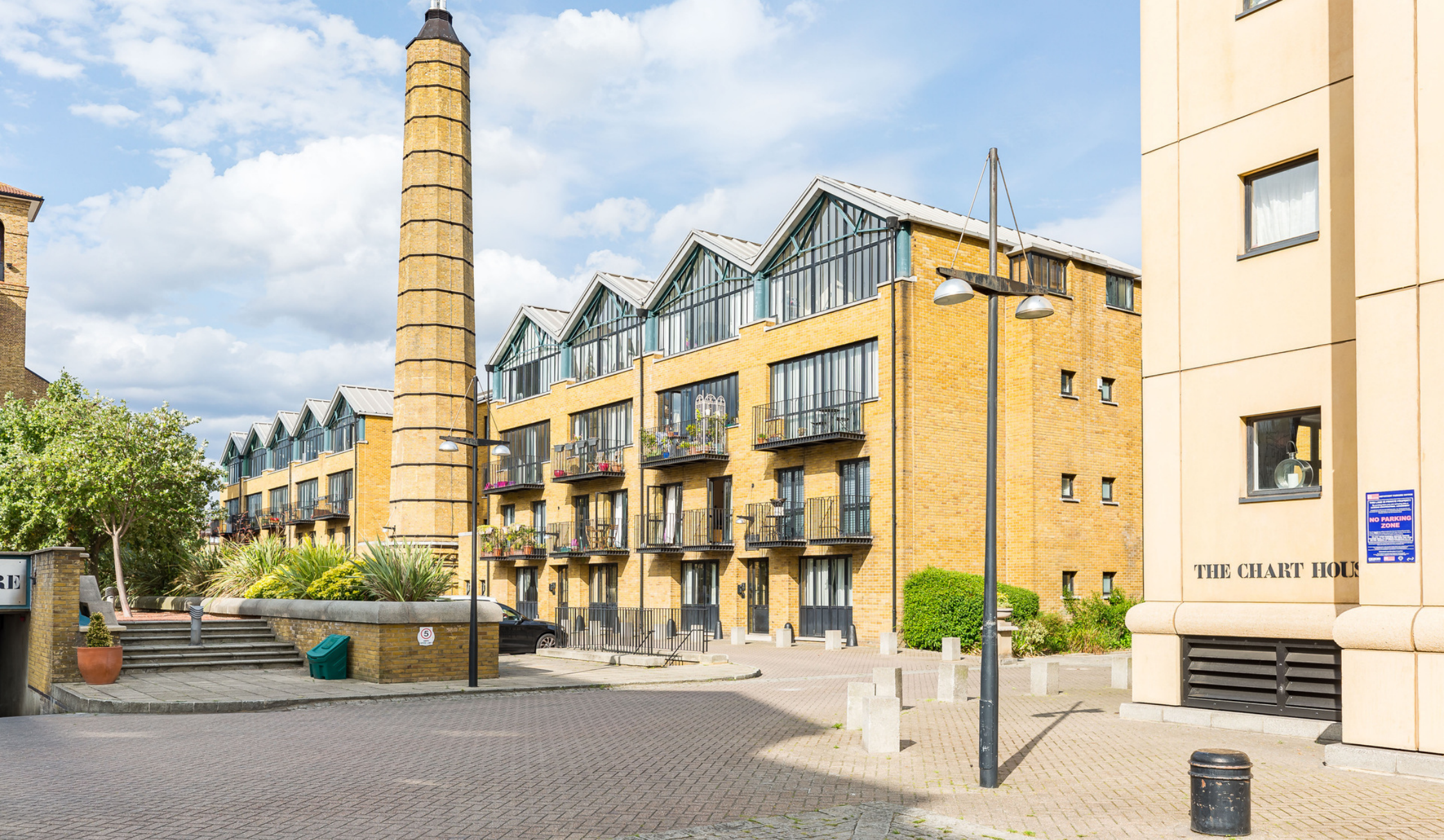
BEACON HOUSE E14 1 bedroom apartment