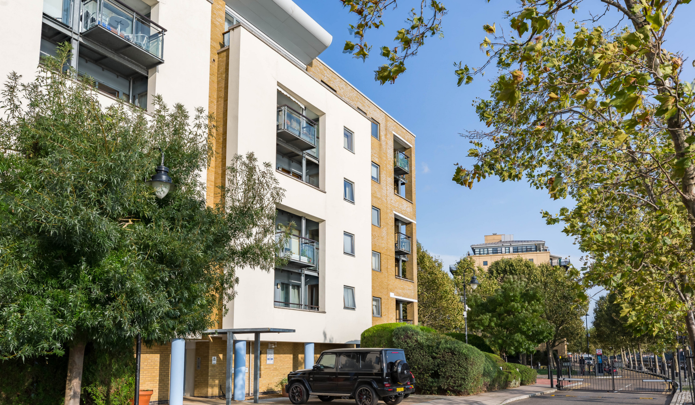
PERRY COURT E14 2 bedroom apartment