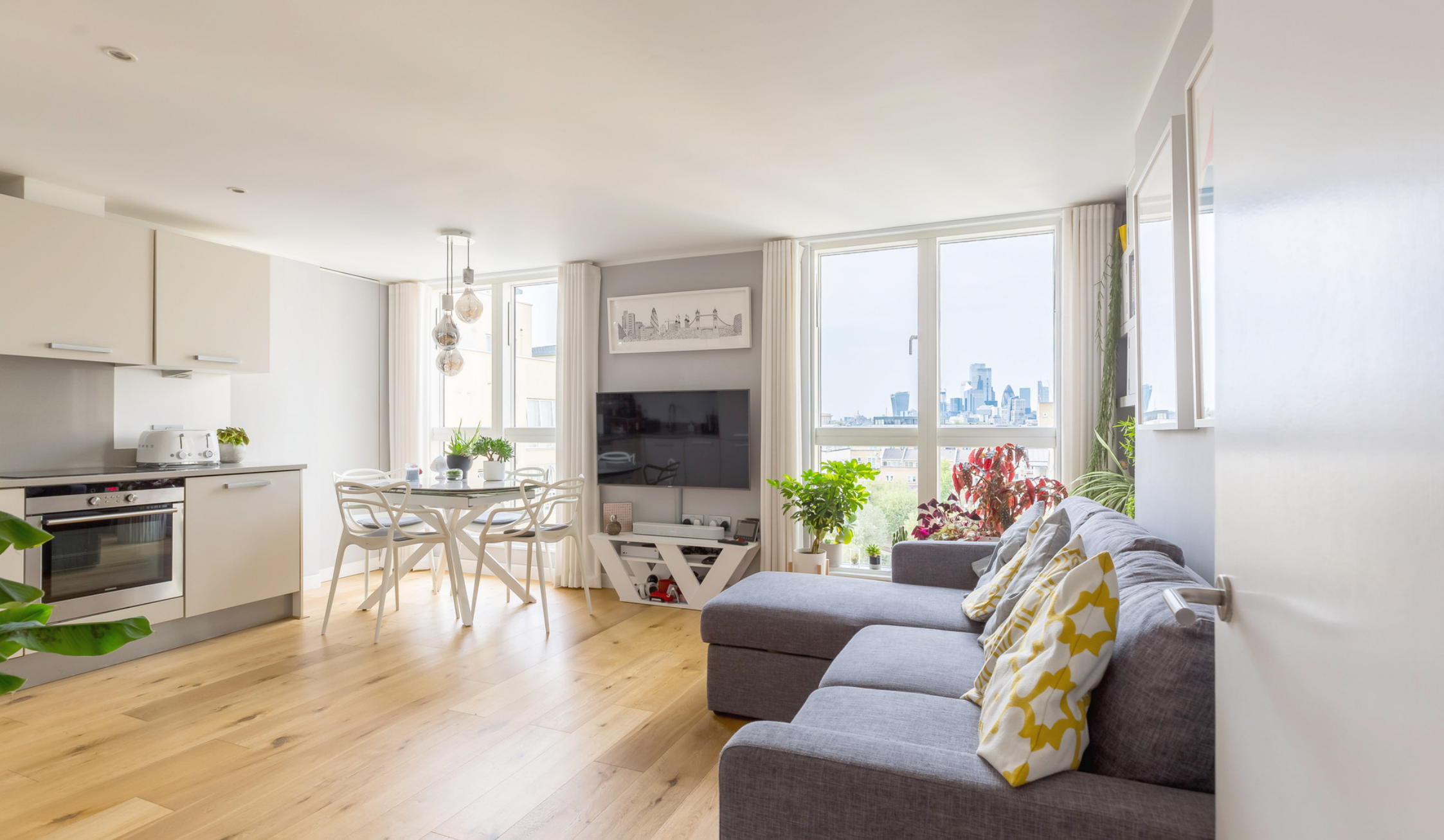
PAVILLION HOUSE SE16 2 bedroom apartment