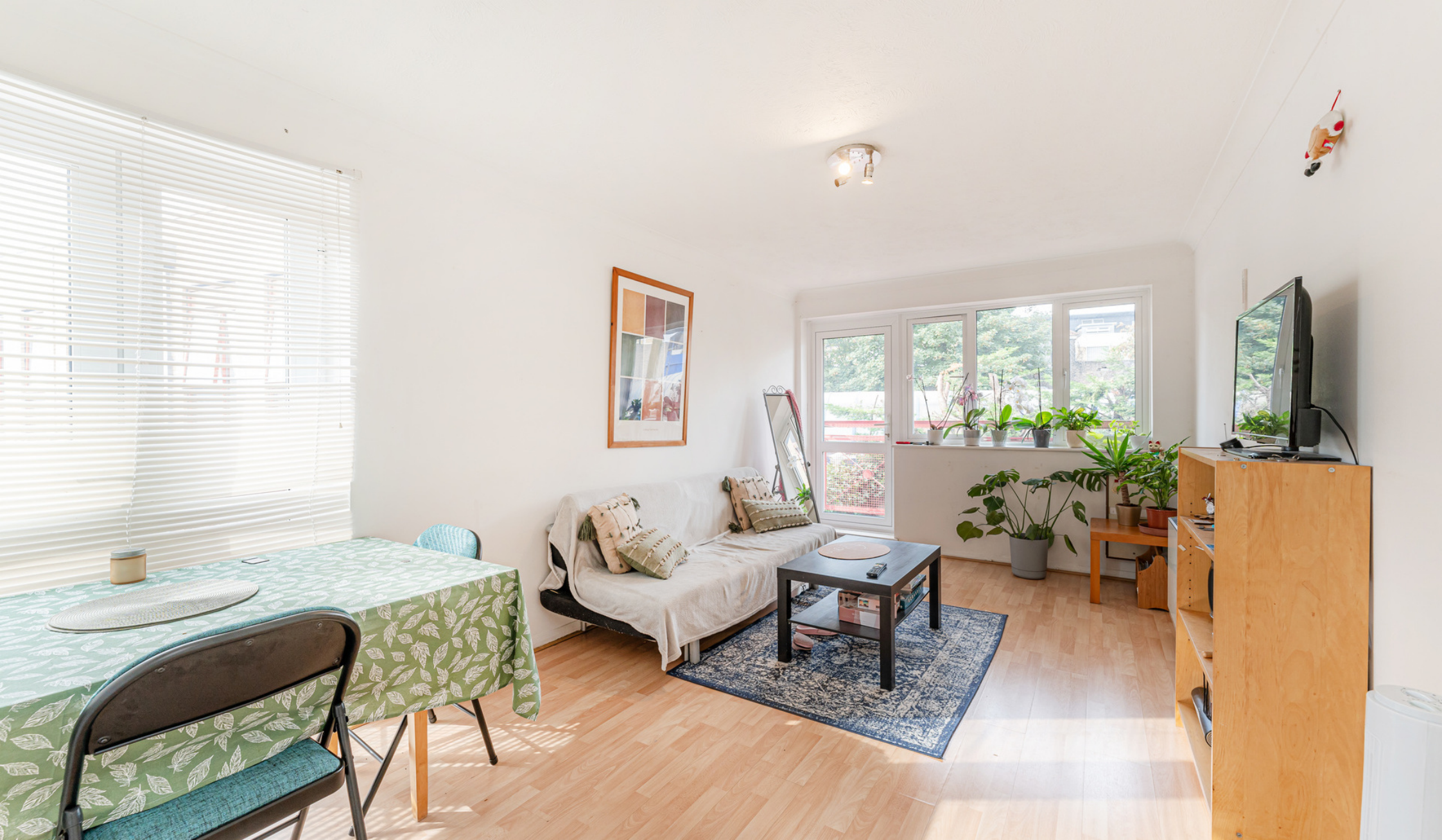
LAVETTE HOUSE E3 1 bedroom apartment