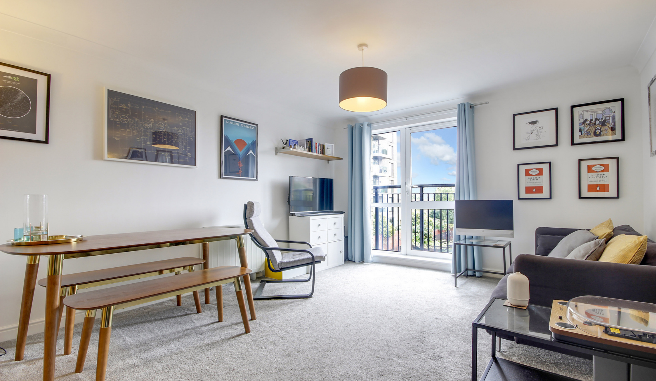
GRAY COURT E1 1 bedroom apartment