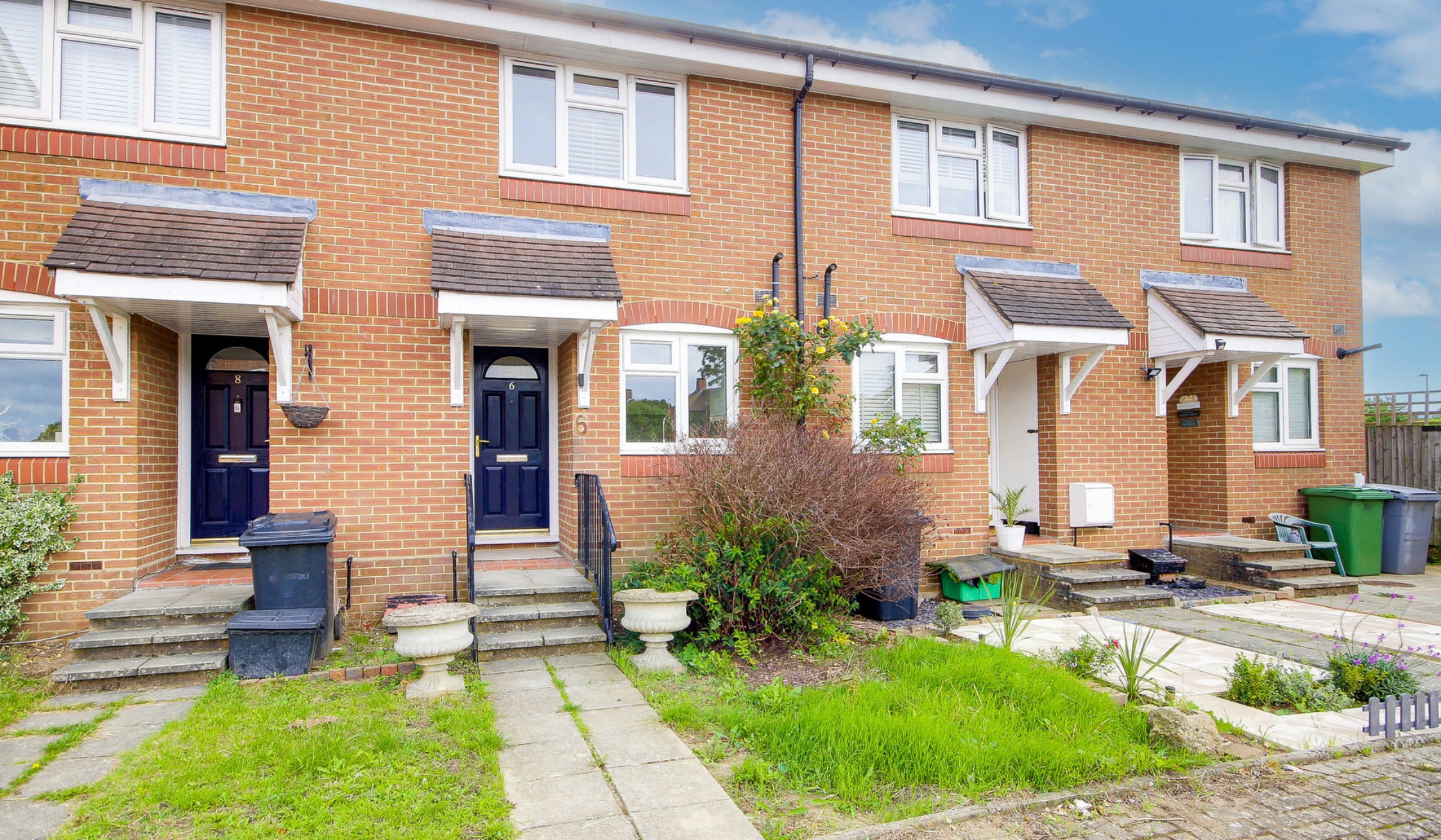
MALLARD WALK BR3 2 bedroom terraced house