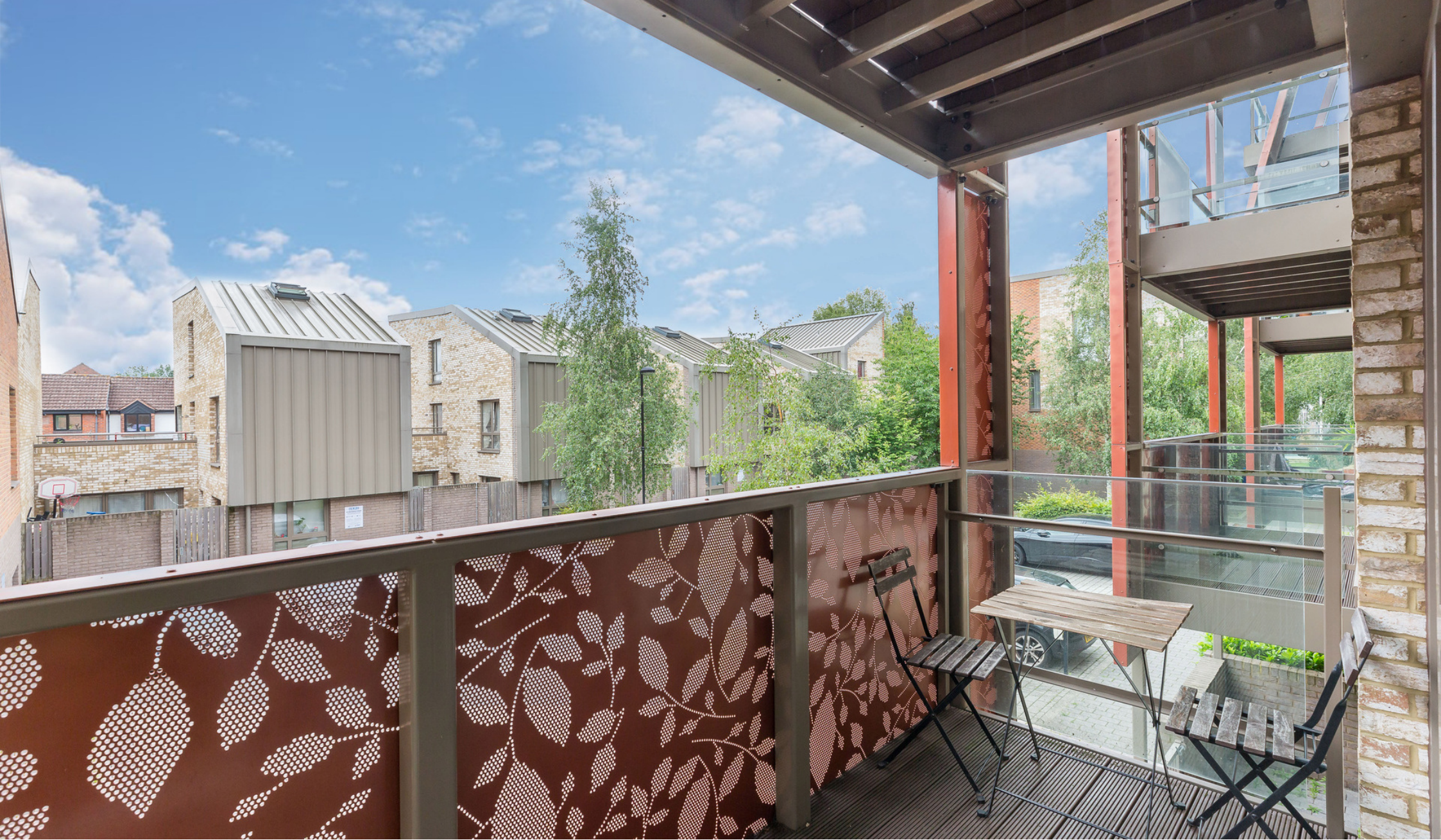
BLACKTHORN HOUSE SE16 1 bedroom apartment