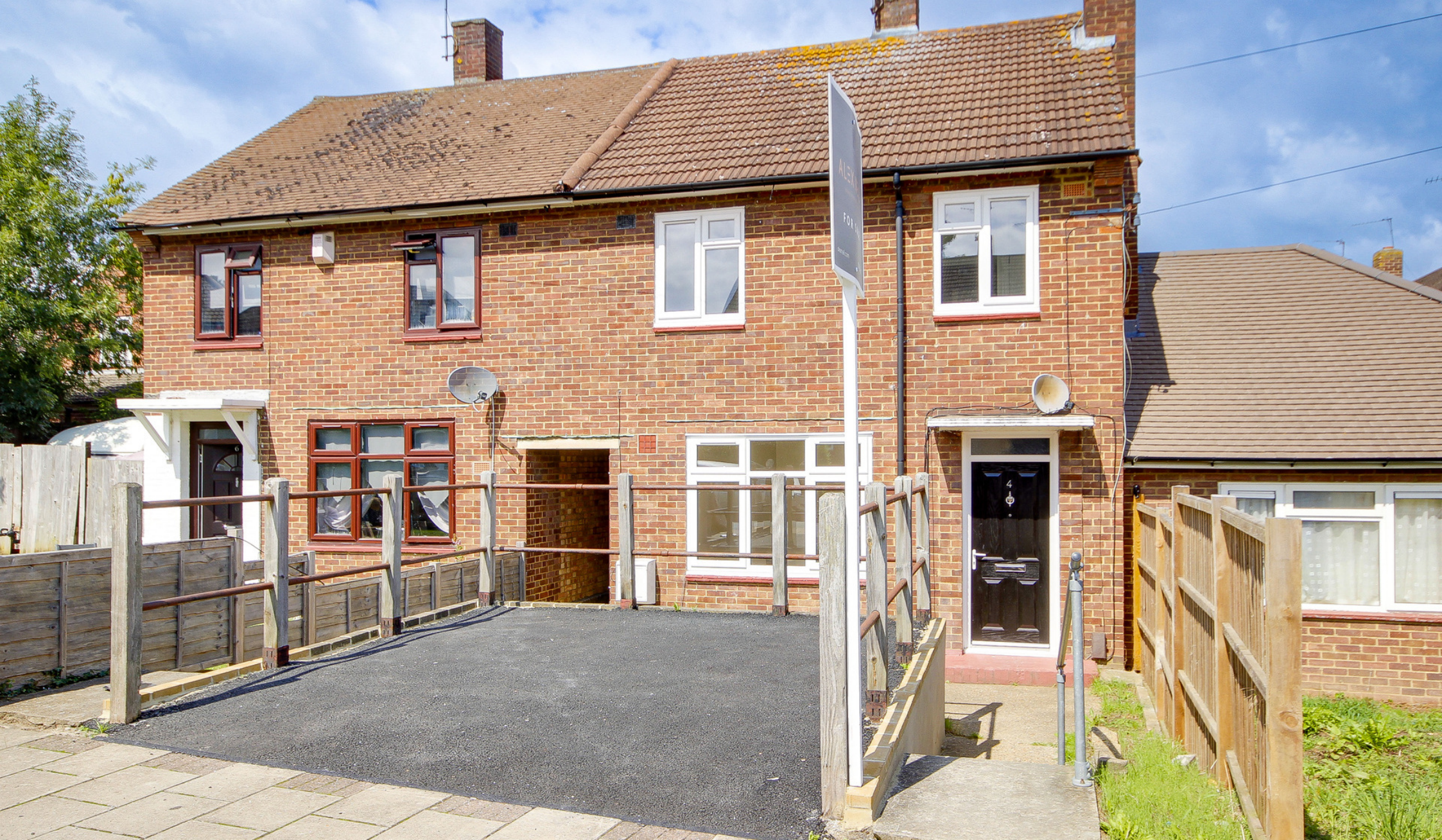
OCKHAM DRIVE BR5 2 bedroom semi-detached house