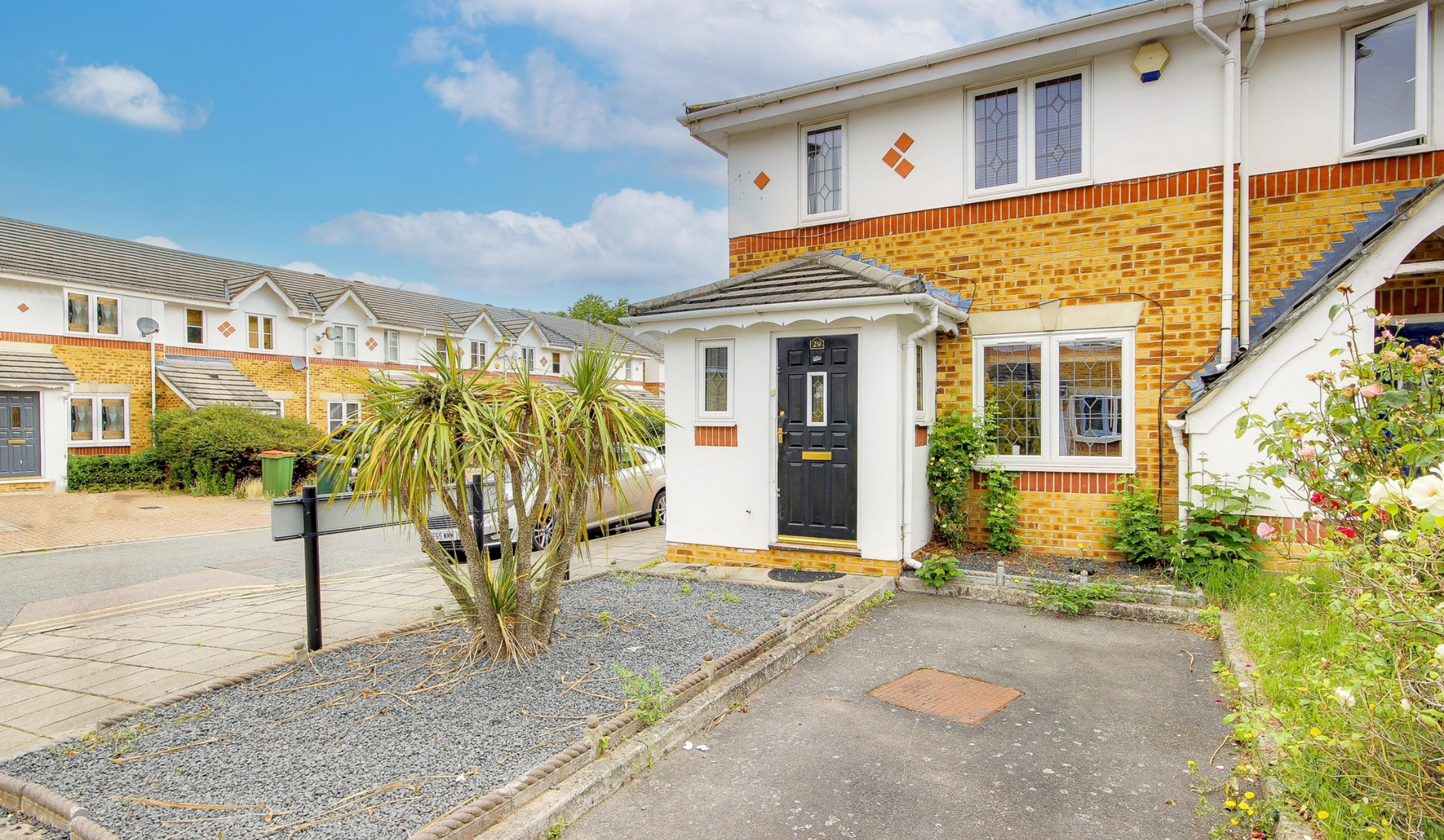
RICHARD HOUSE DRIVE E16 3 bedroom end of terrace