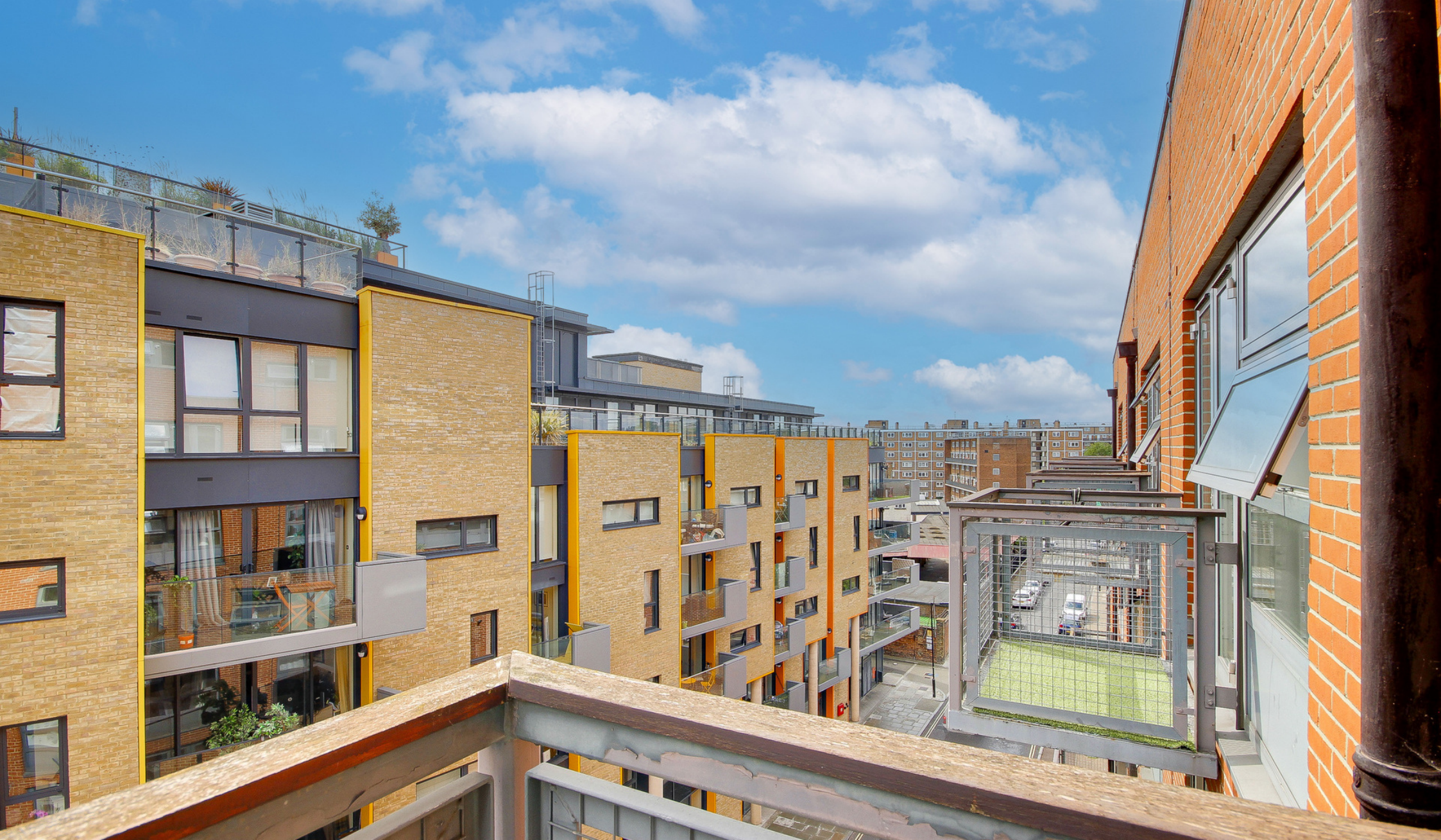
FLORIN COURT SE1 1 bedroom duplex apartment