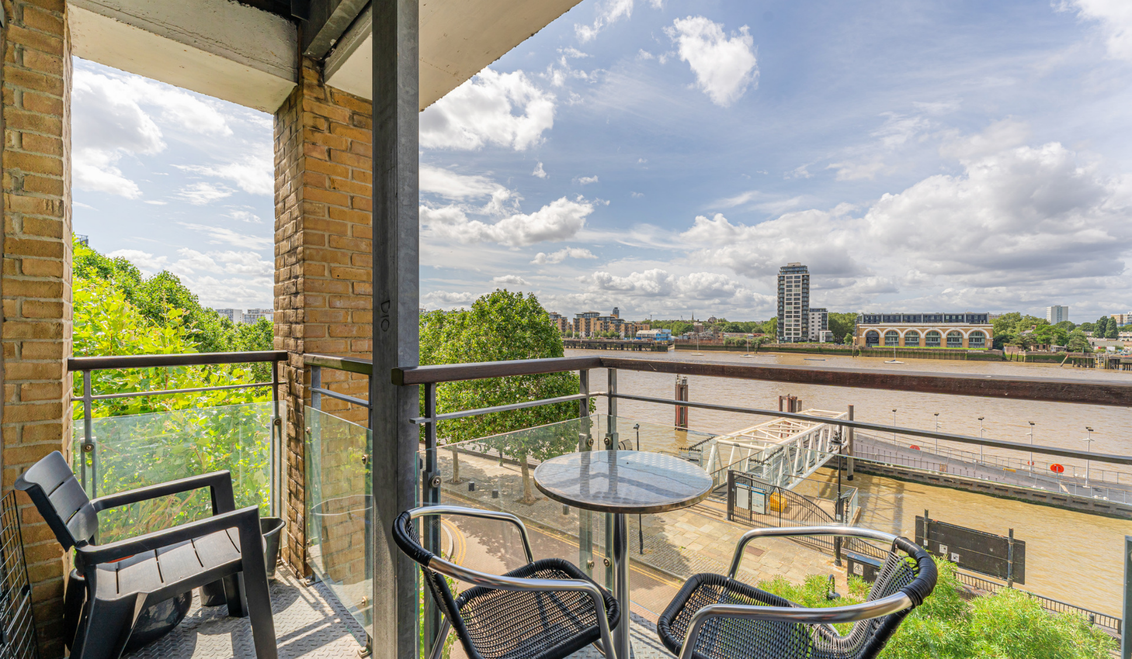
PERRY COURT E14 2 bedroom apartment