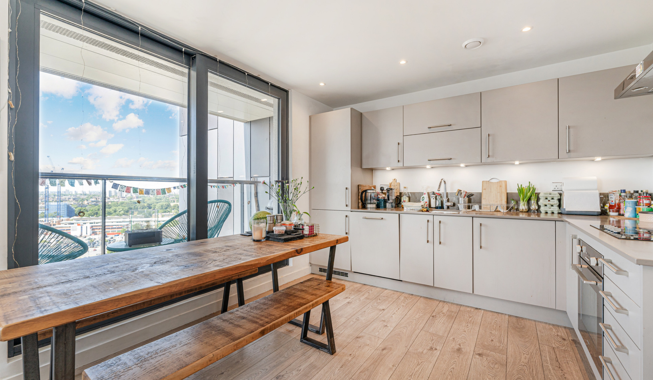
CHANCELLOR HOUSE SE16 2 bedroom apartment