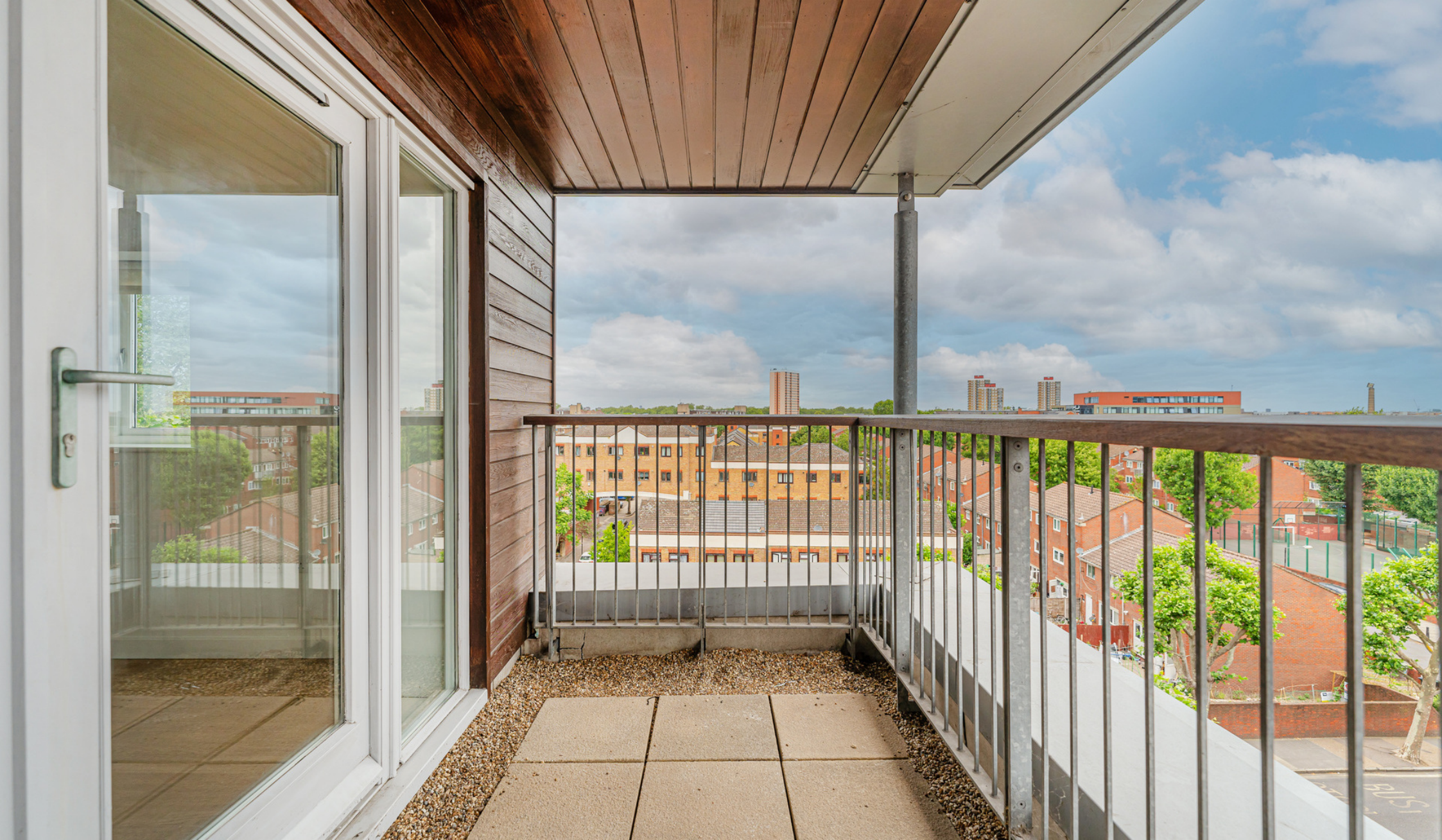
BEVAN COURT E3 1 bedroom apartment