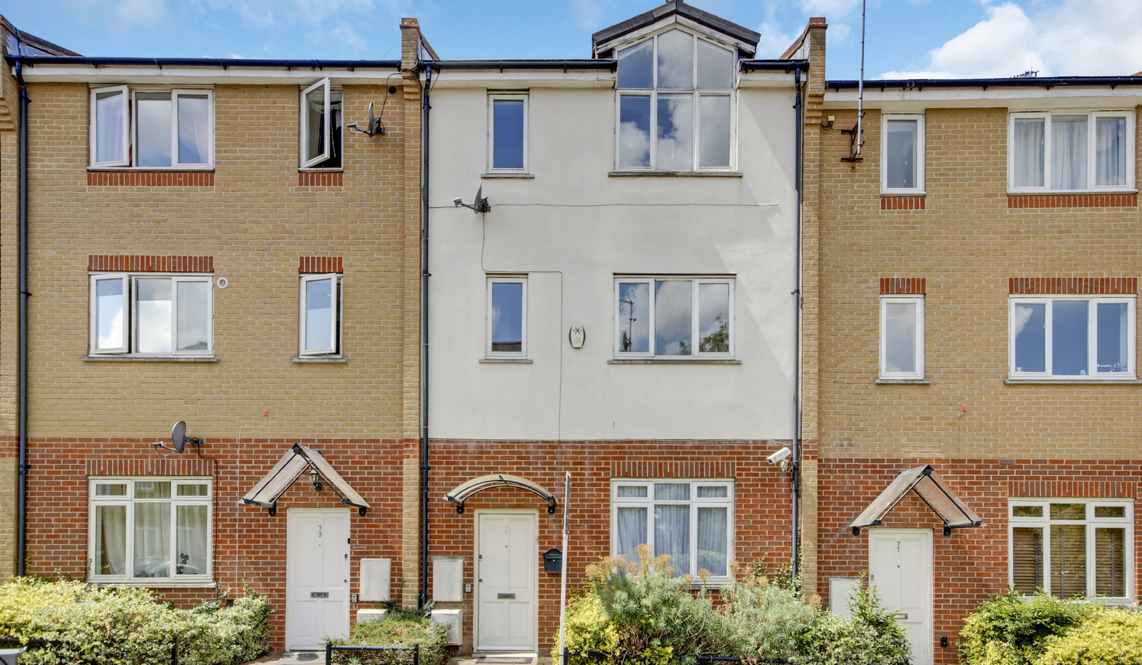
ENTERPRIZE WAY SE8 3 bedroom town house