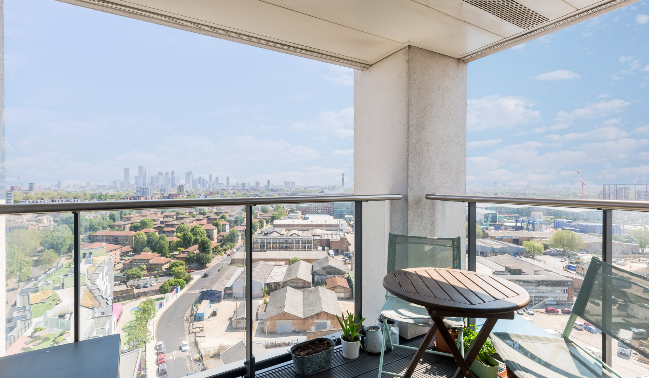
CHANCELLOR HOUSE SE16 2 bedroom apartment