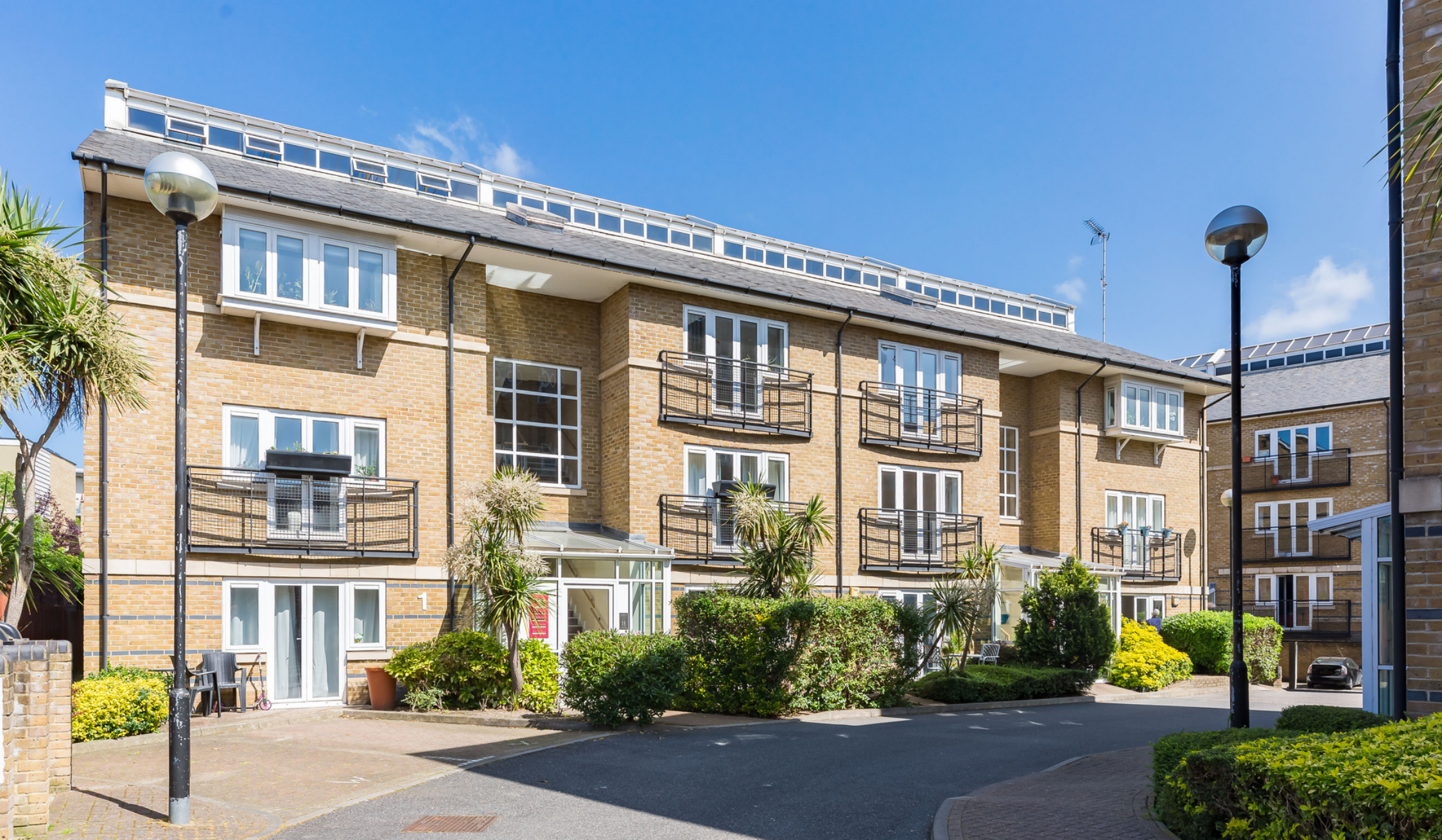
MENAI PLACE E3 1 bedroom apartment