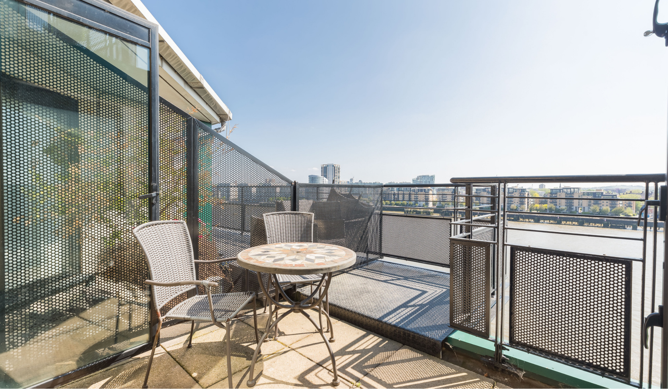
CHART HOUSE E14 2 bedroom apartment