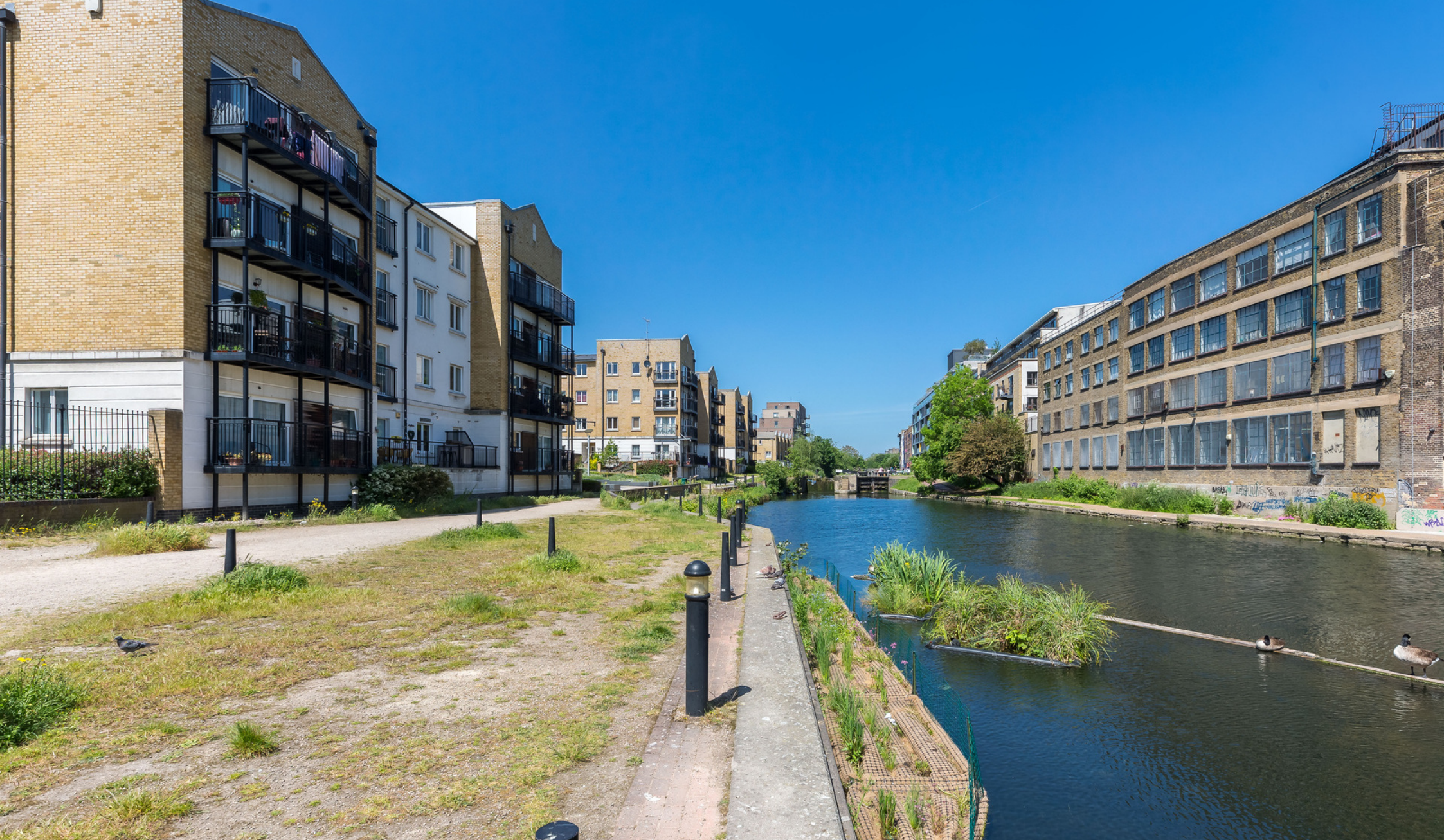
GRAY COURT E1 1 bedroom apartment