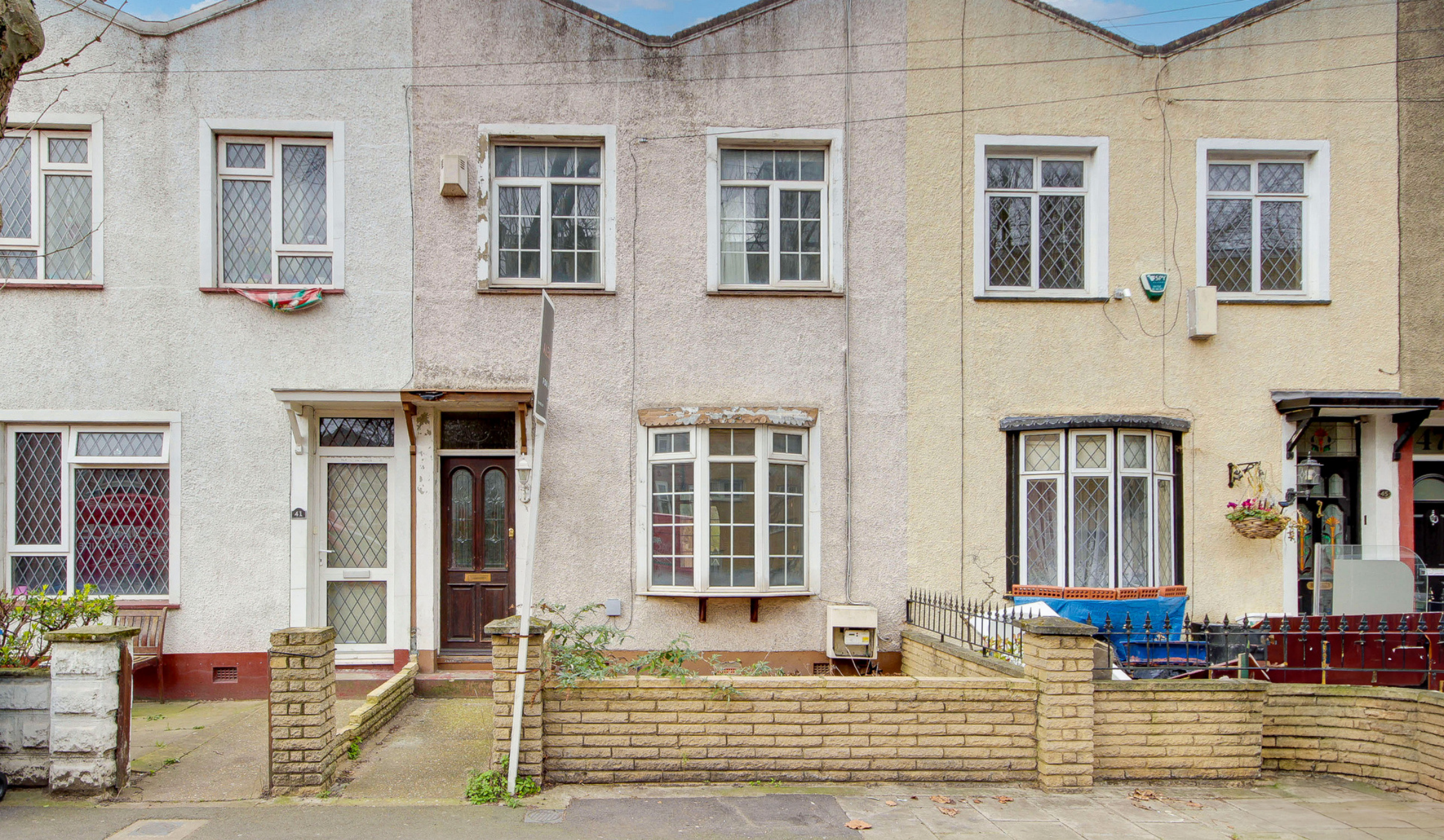
PLOUGH WAY SE16 3 bedroom terraced house