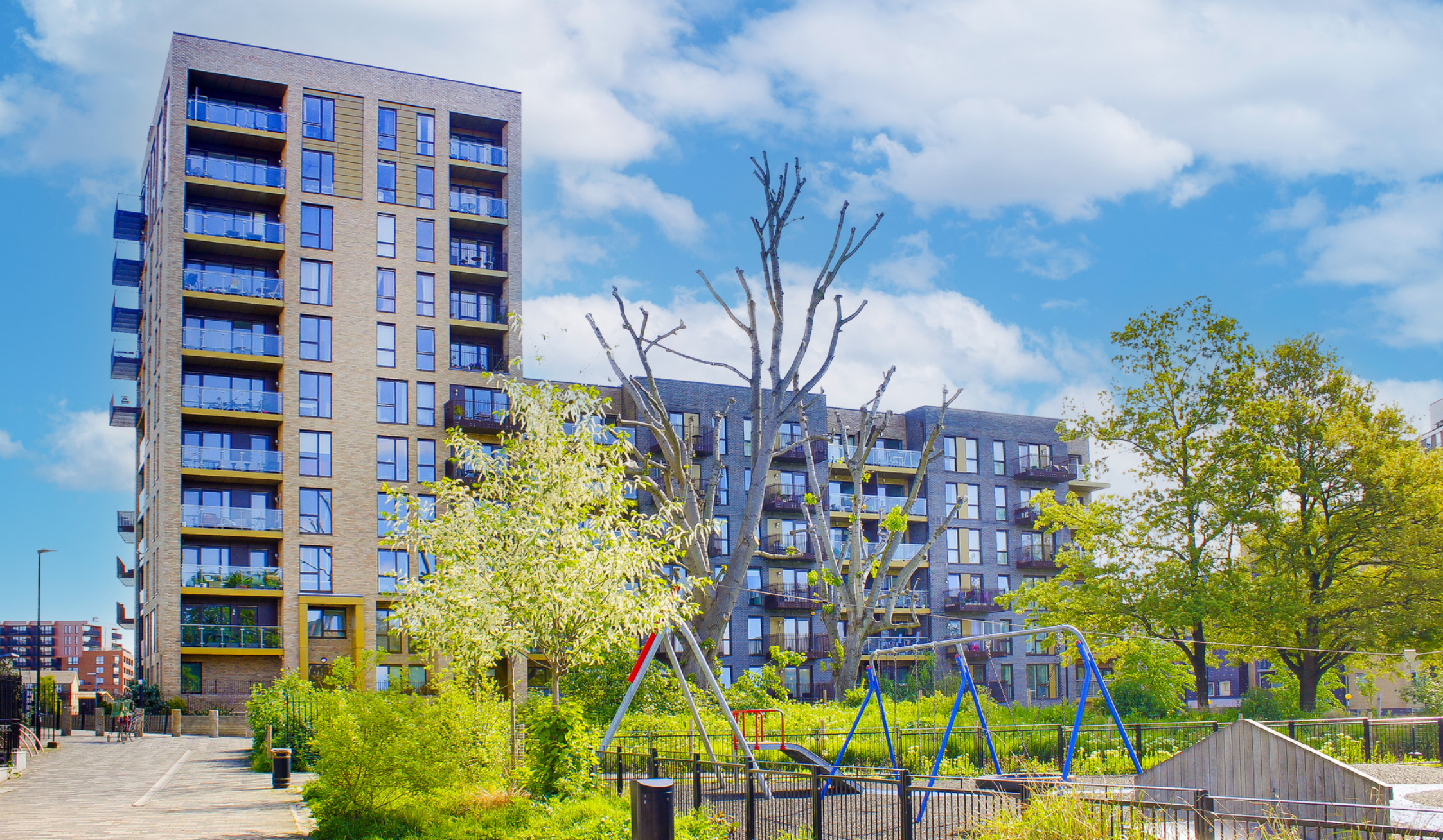
WIMHURST COURT E14 2 bedroom apartment