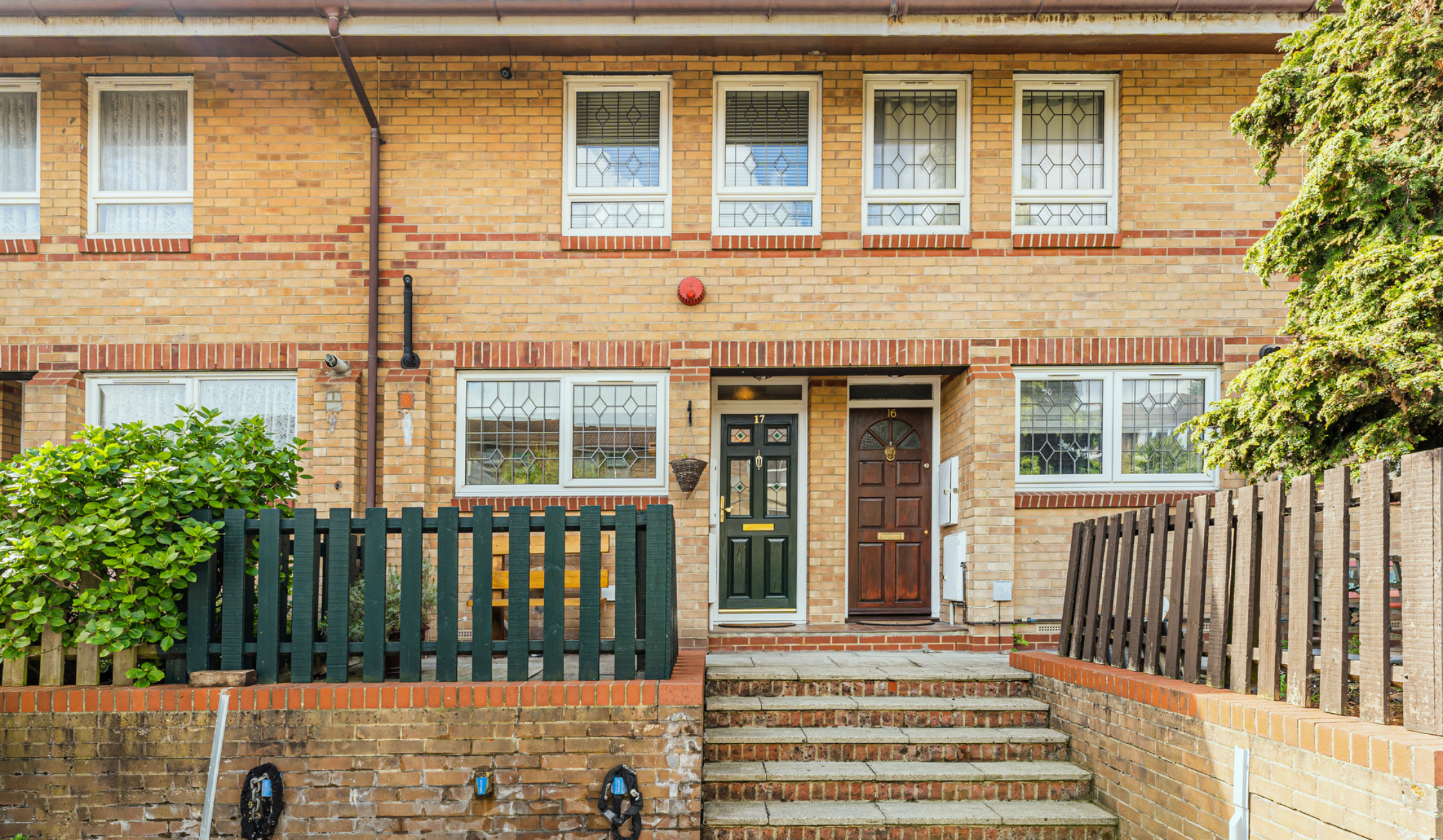
GERARDS CLOSE SE16 2 bedroom terraced house