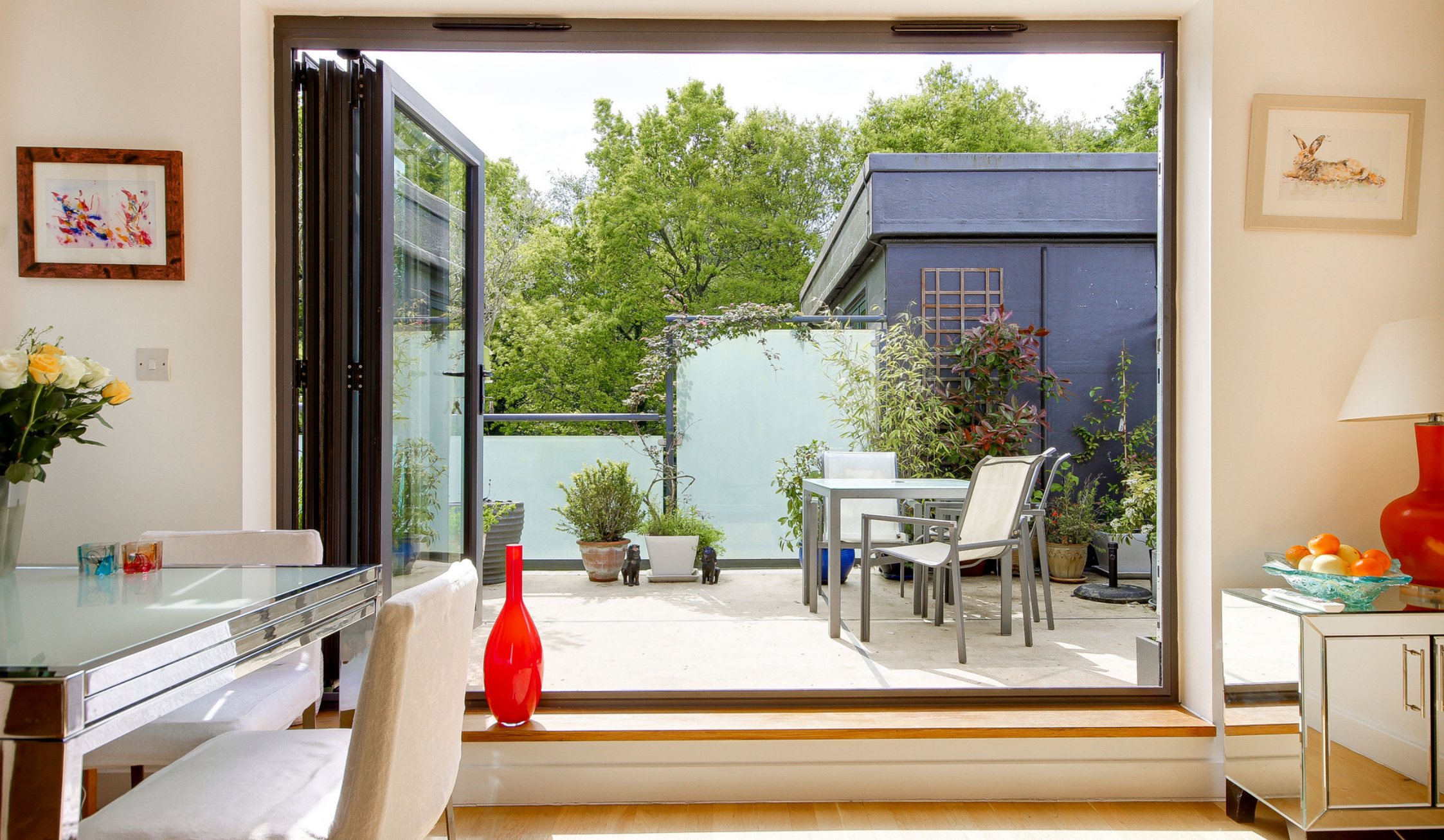
FURZE LODGE SE18 1 bedroom apartment