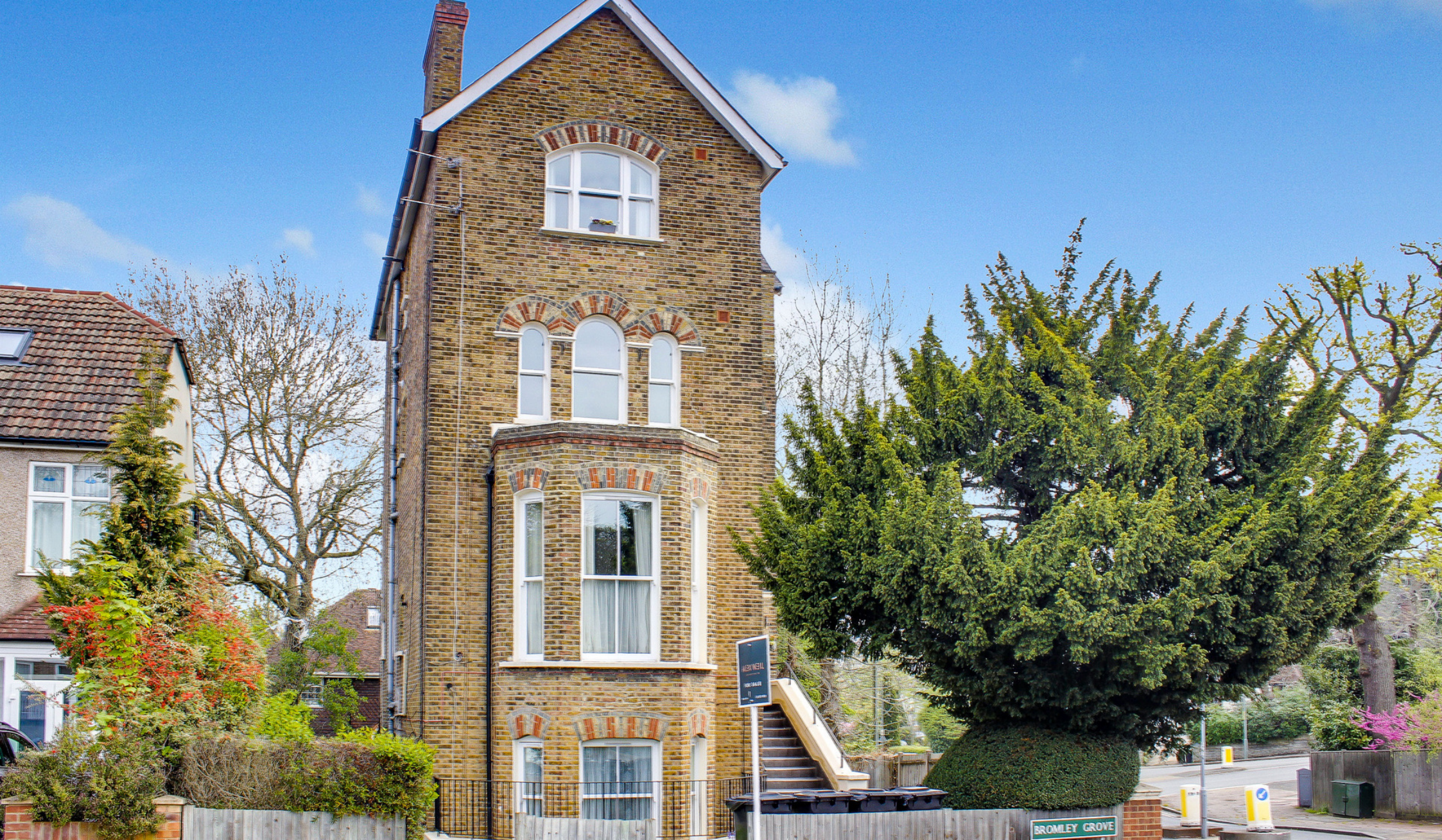
BROMLEY GROVE BR2 2 bedroom apartment