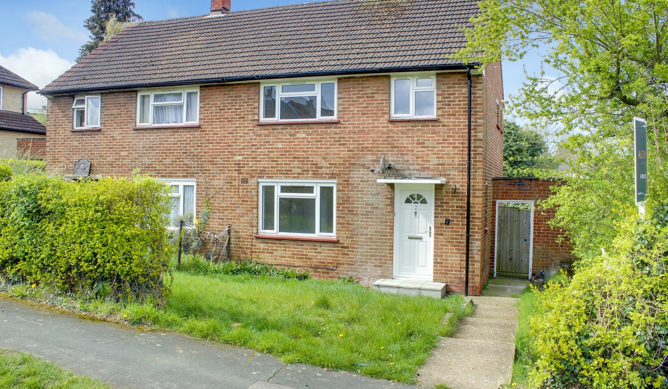
NETLEY CLOSE CRO 3 bedroom semi-detached house