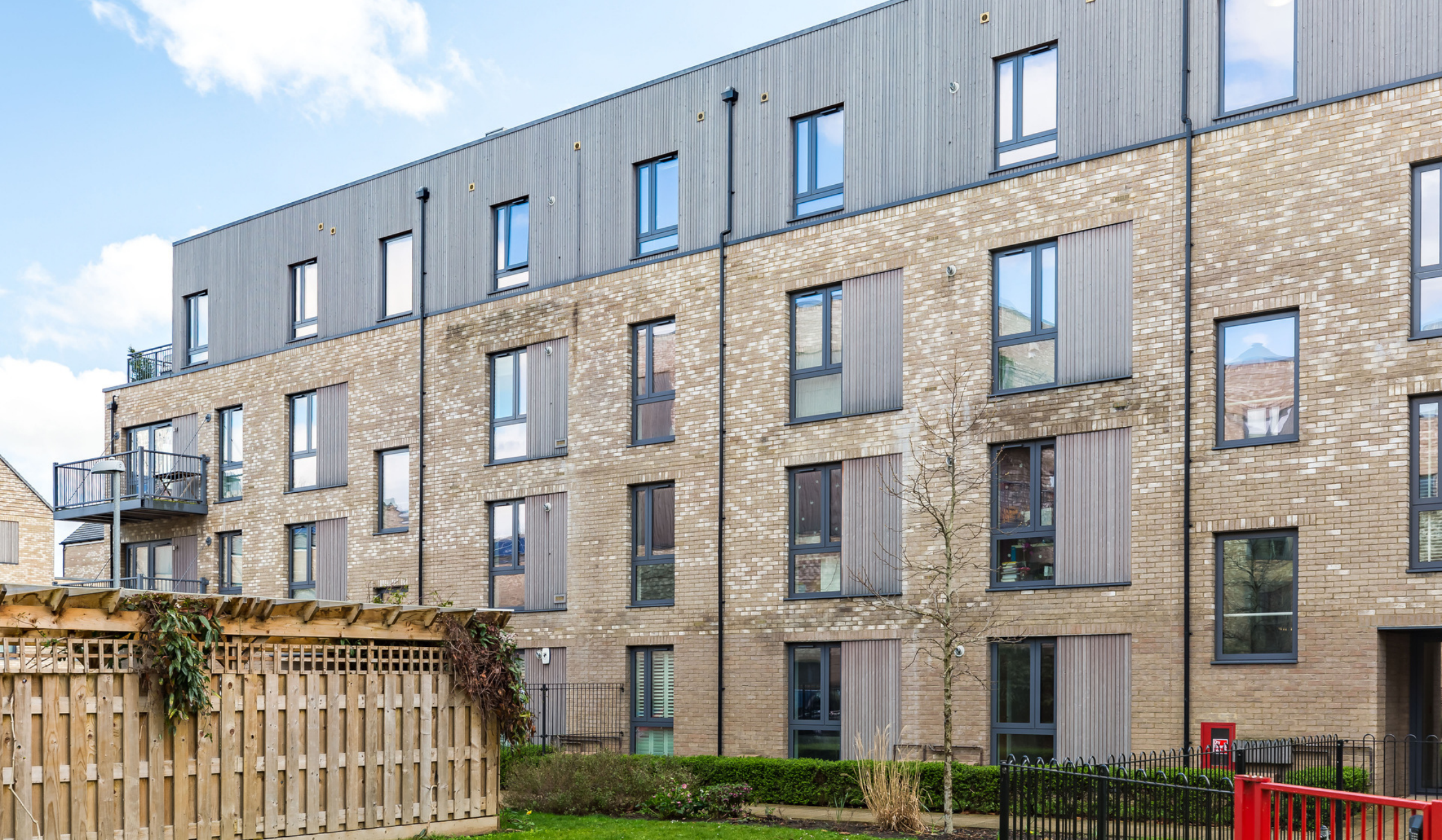
FISHER CLOSE SE16 2 bedroom apartment