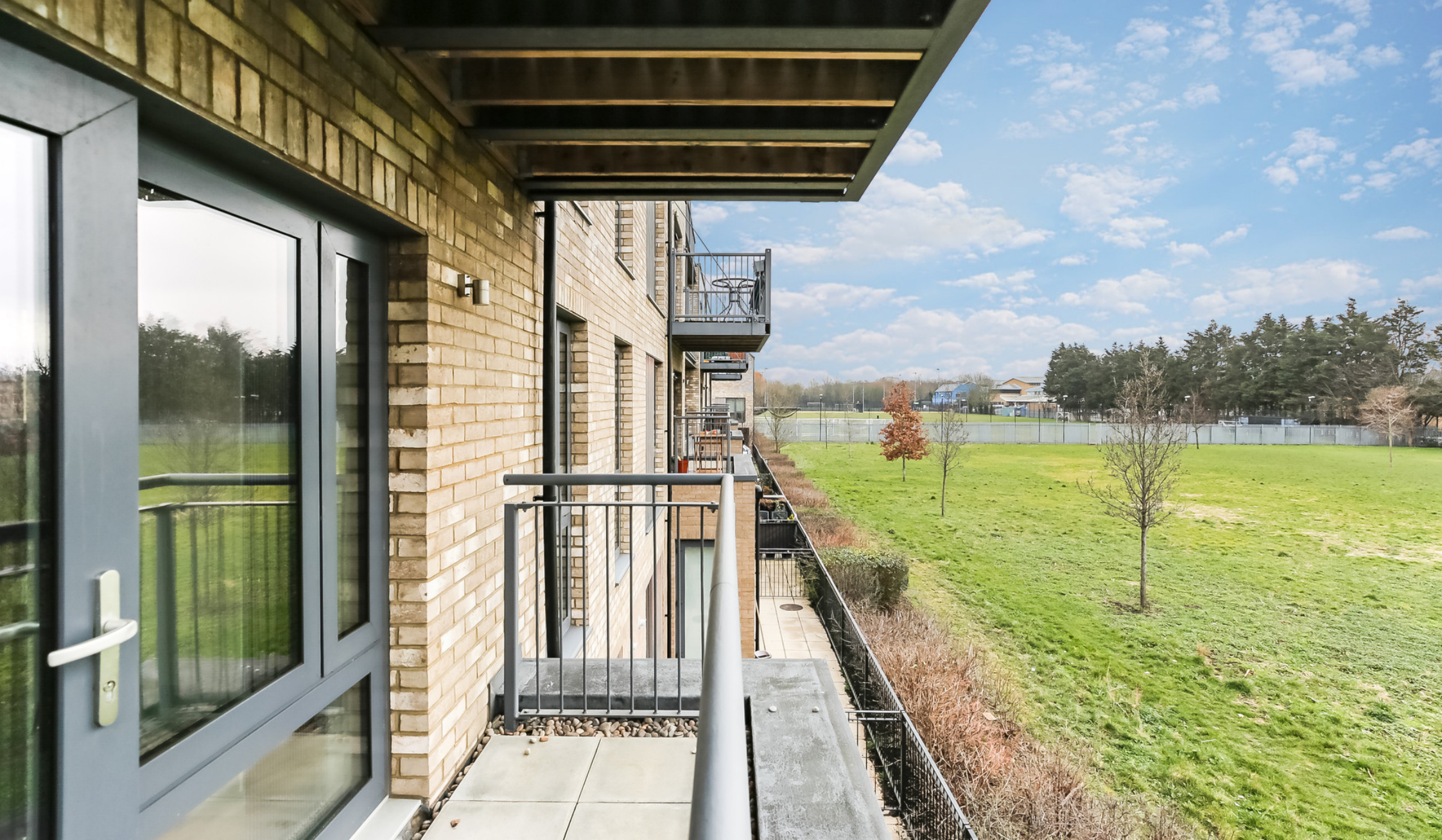
FISHER CLOSE SE16 2 bedroom apartment