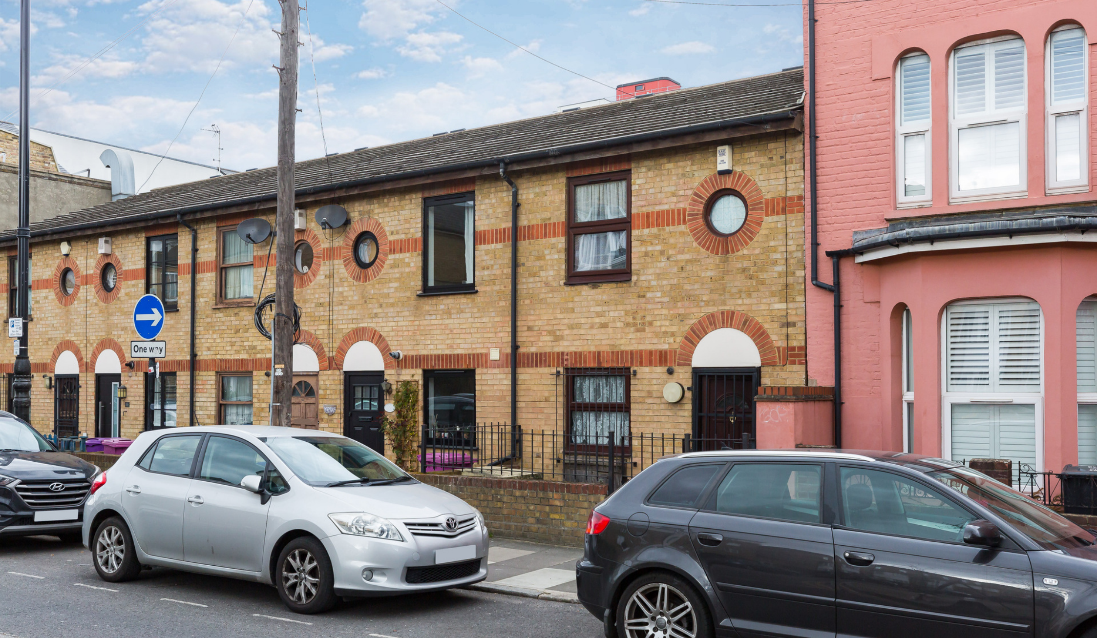
OLD FORD ROAD E3 2 bedroom terraced house