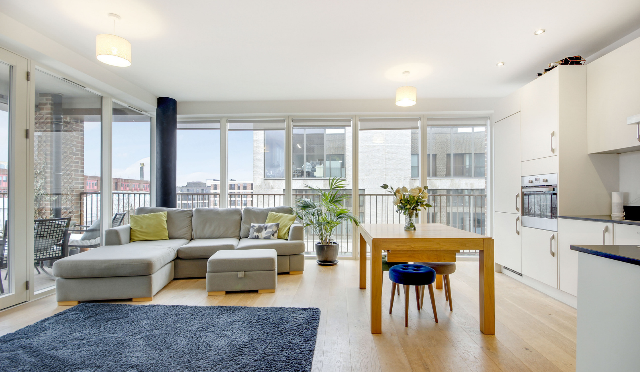
ALLOY COURT E3 2 bedroom apartment