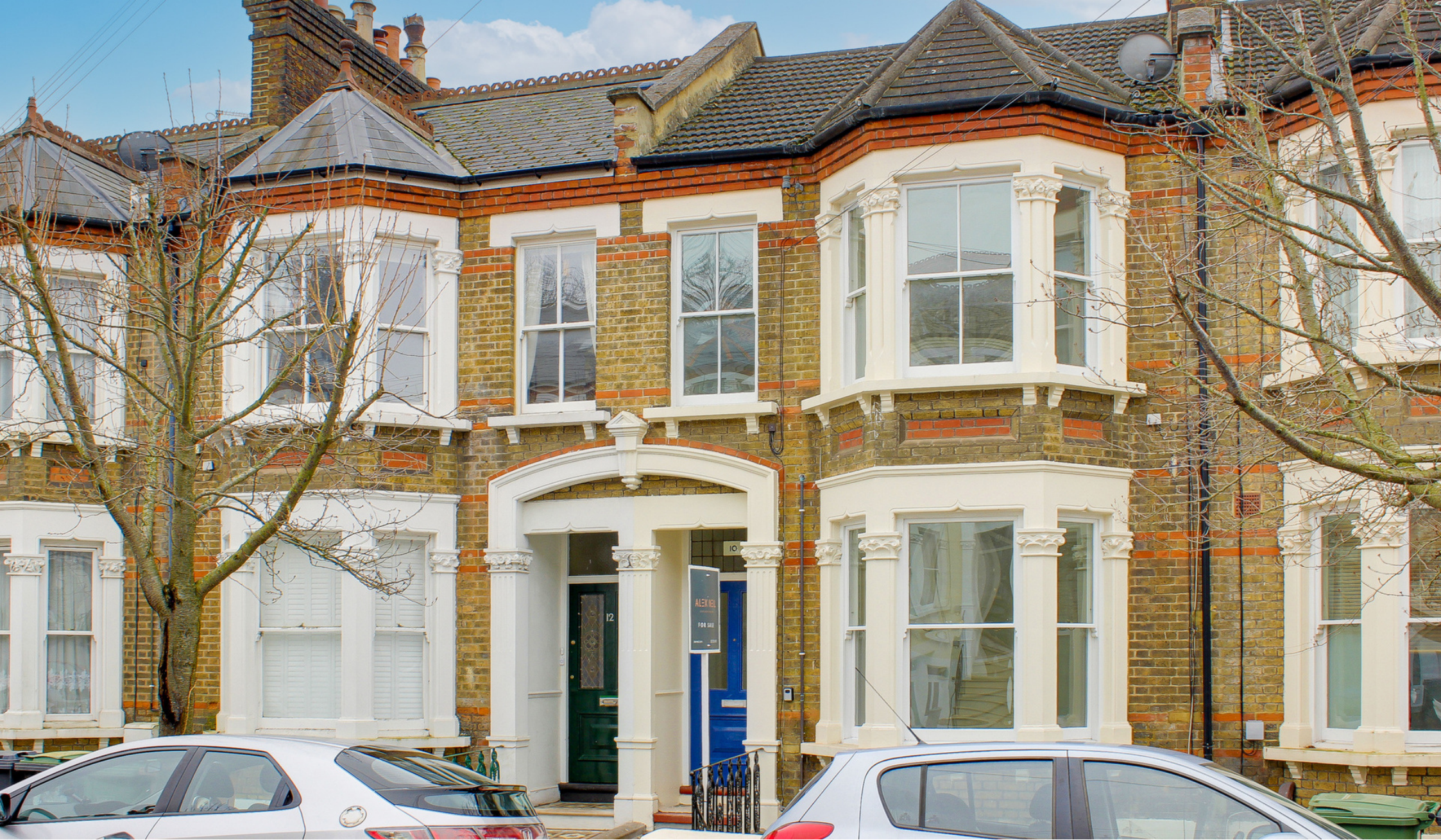
PENDRELL ROAD SE4 3 bedroom maisonette