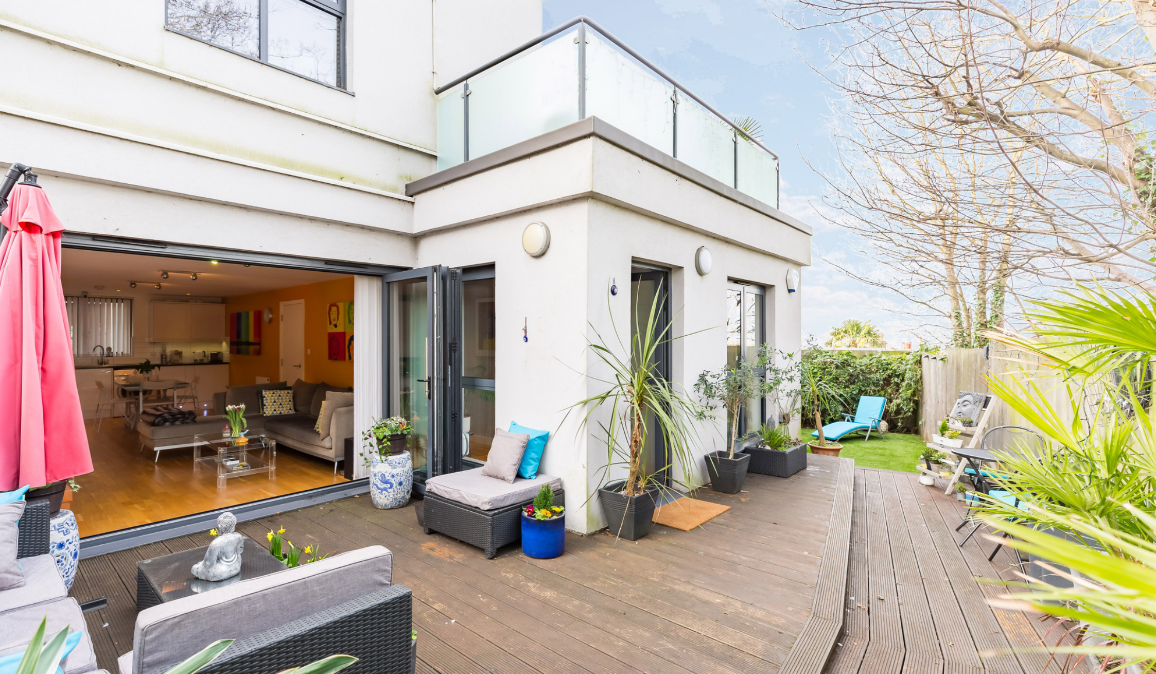
FURZE LODGE SE18 2 bedroom apartment