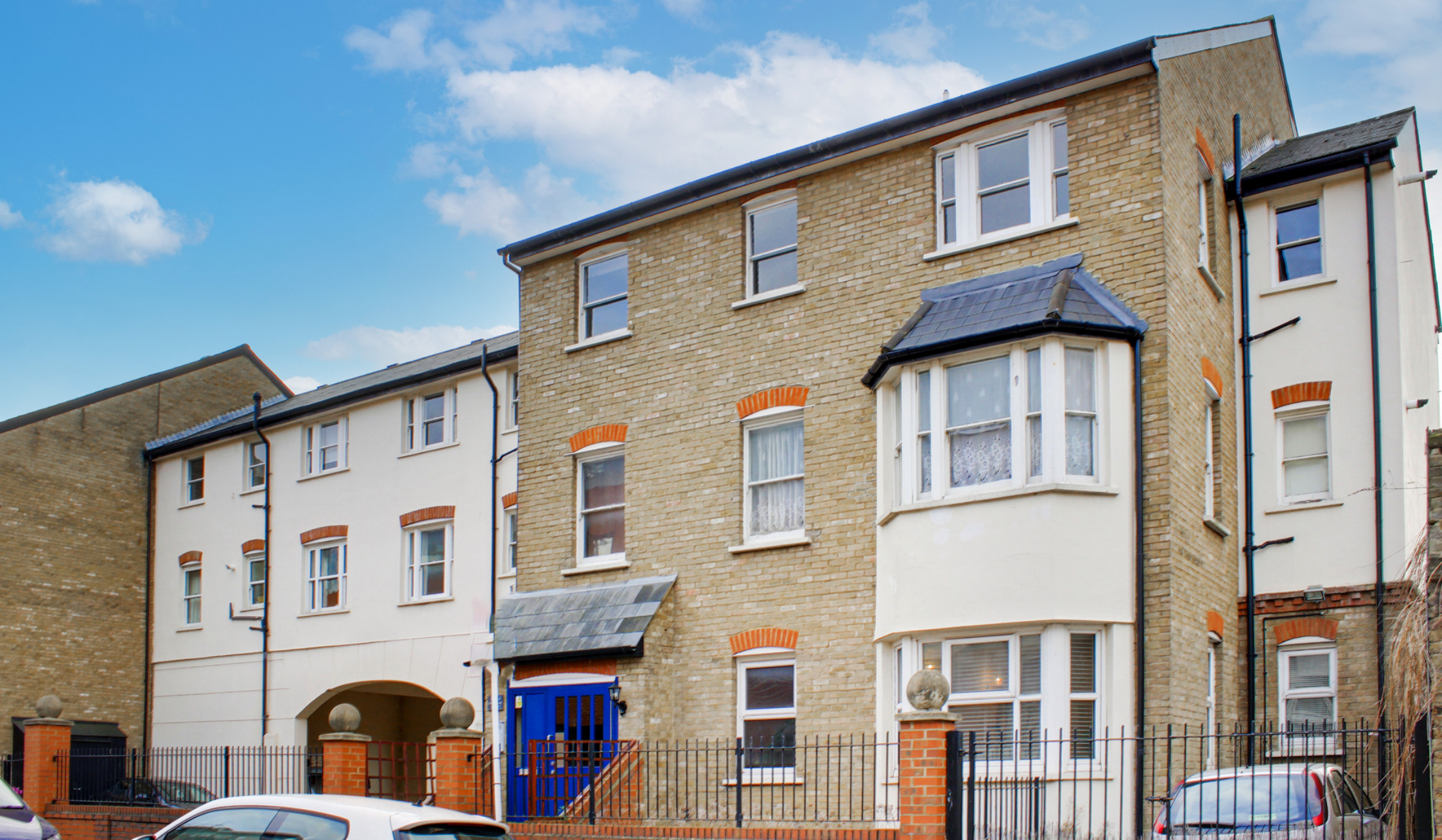
ORDELL COURT E3 2 bedroom apartment