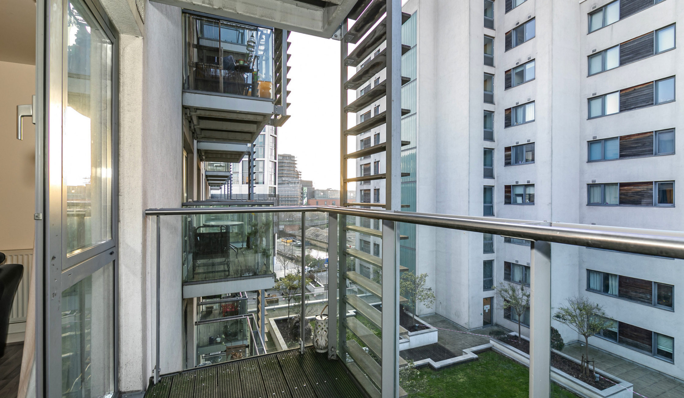
JOHN WETHERBY COURT EAST E15 2 bedroom apartment