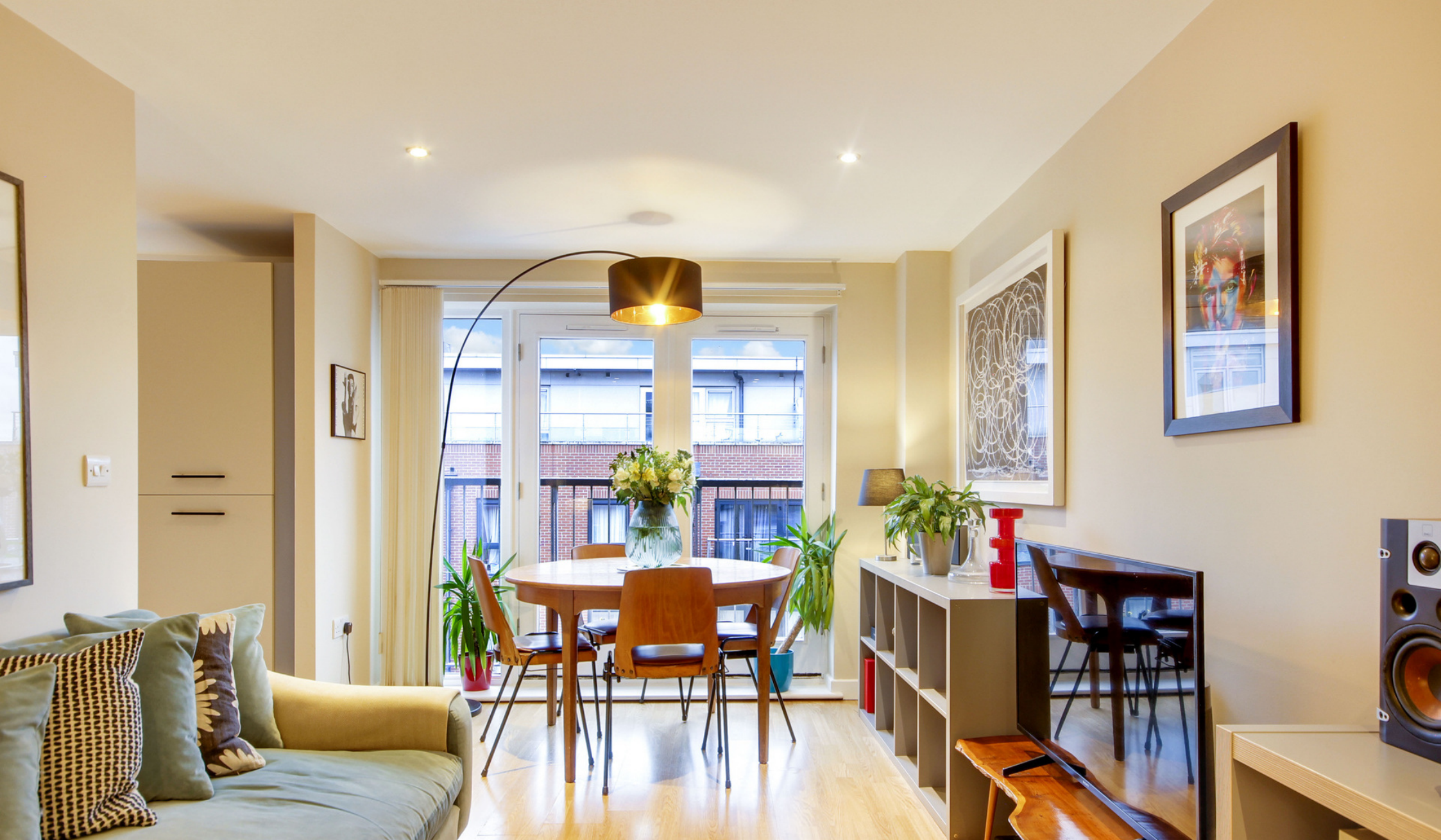
GARWAY COURT E3 1 bedroom apartment