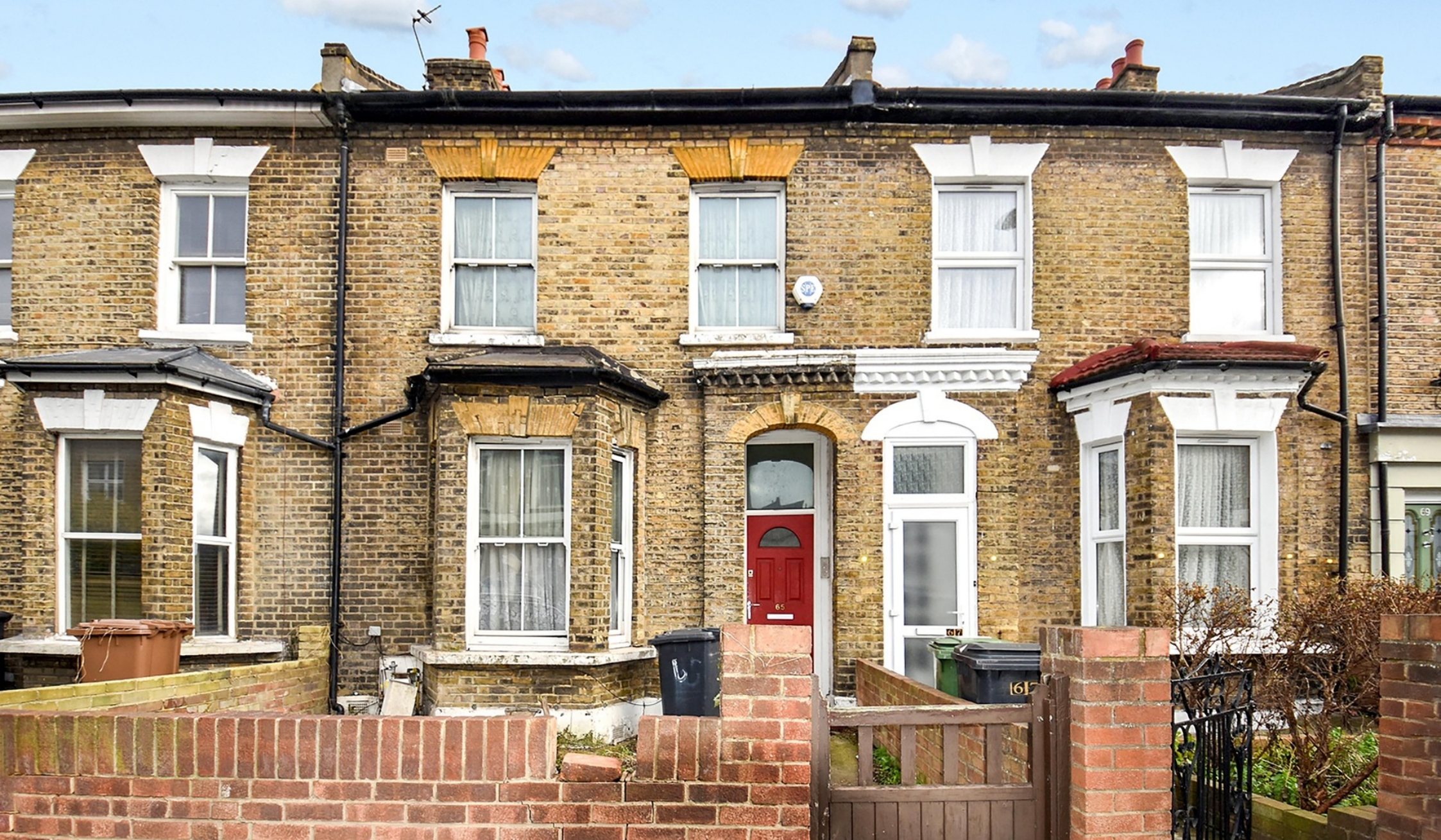
LAUSANNE ROAD SE15 3 bedroom terraced house