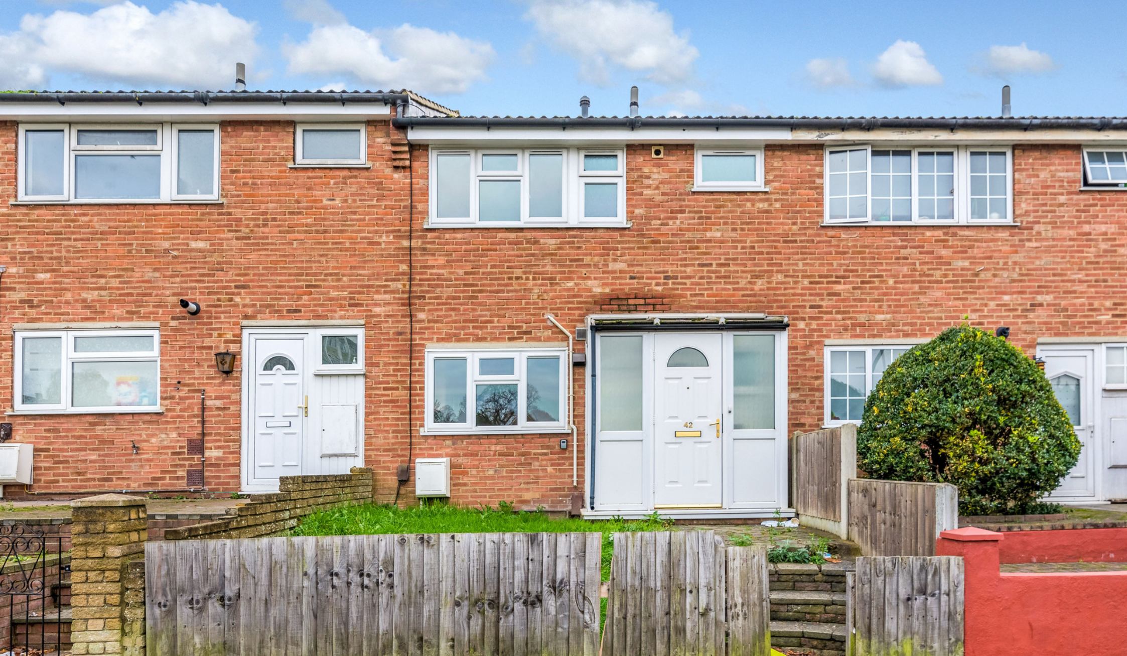
COTMANDENE CRESCENT BR5 3 bedroom terraced house