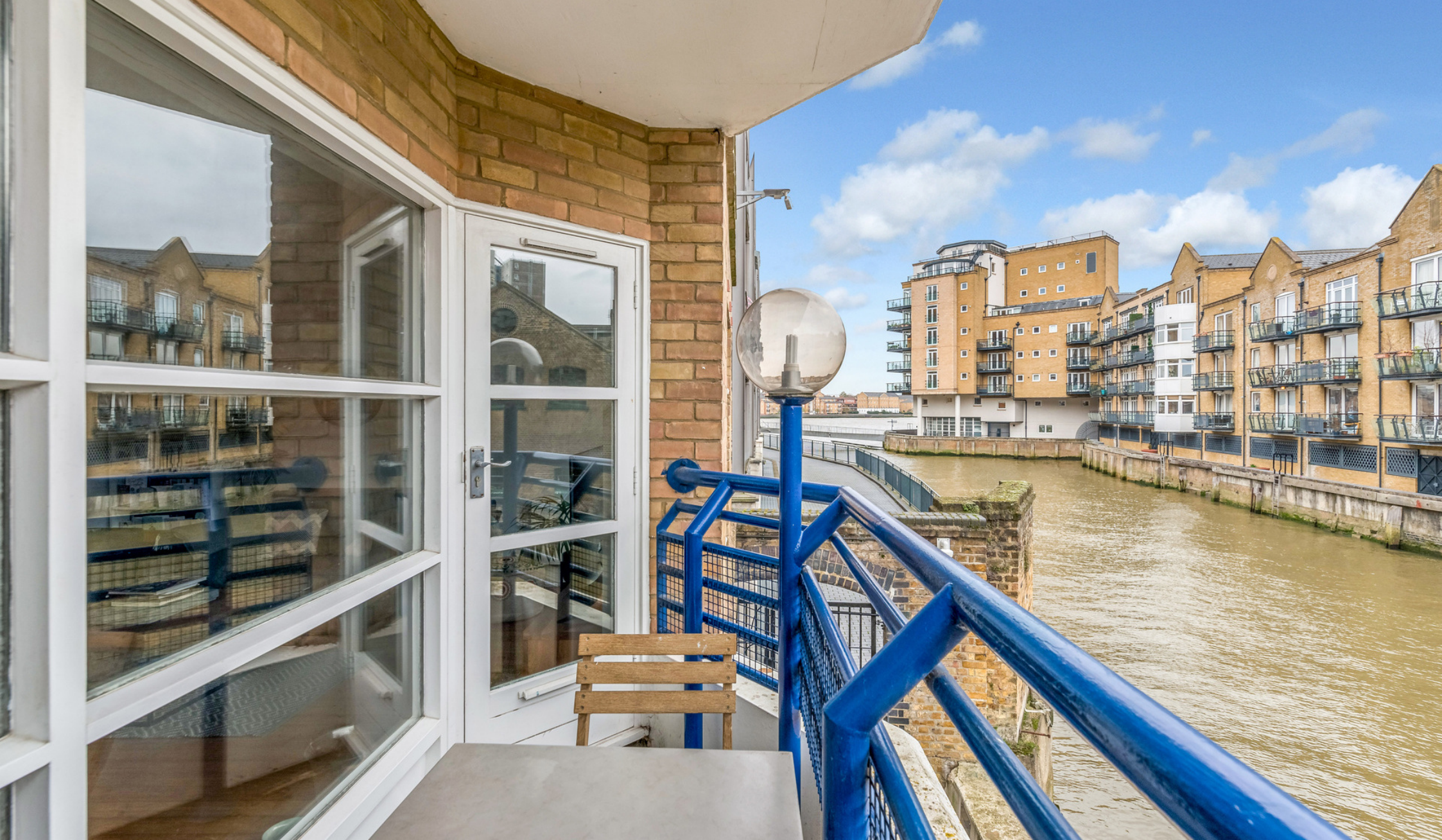
LIME KILN WHARF E14 2 bedroom apartment