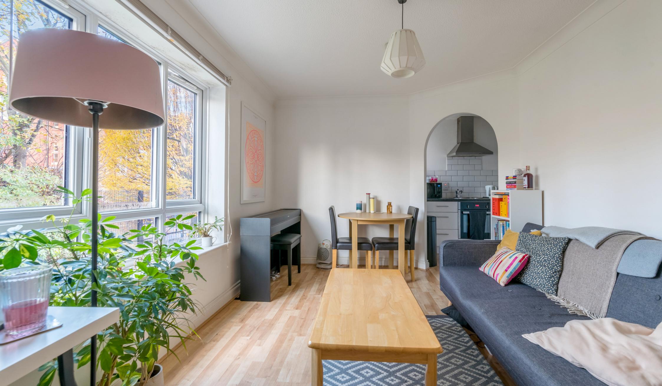
BURNABY COURT SE16 1 bedroom apartment