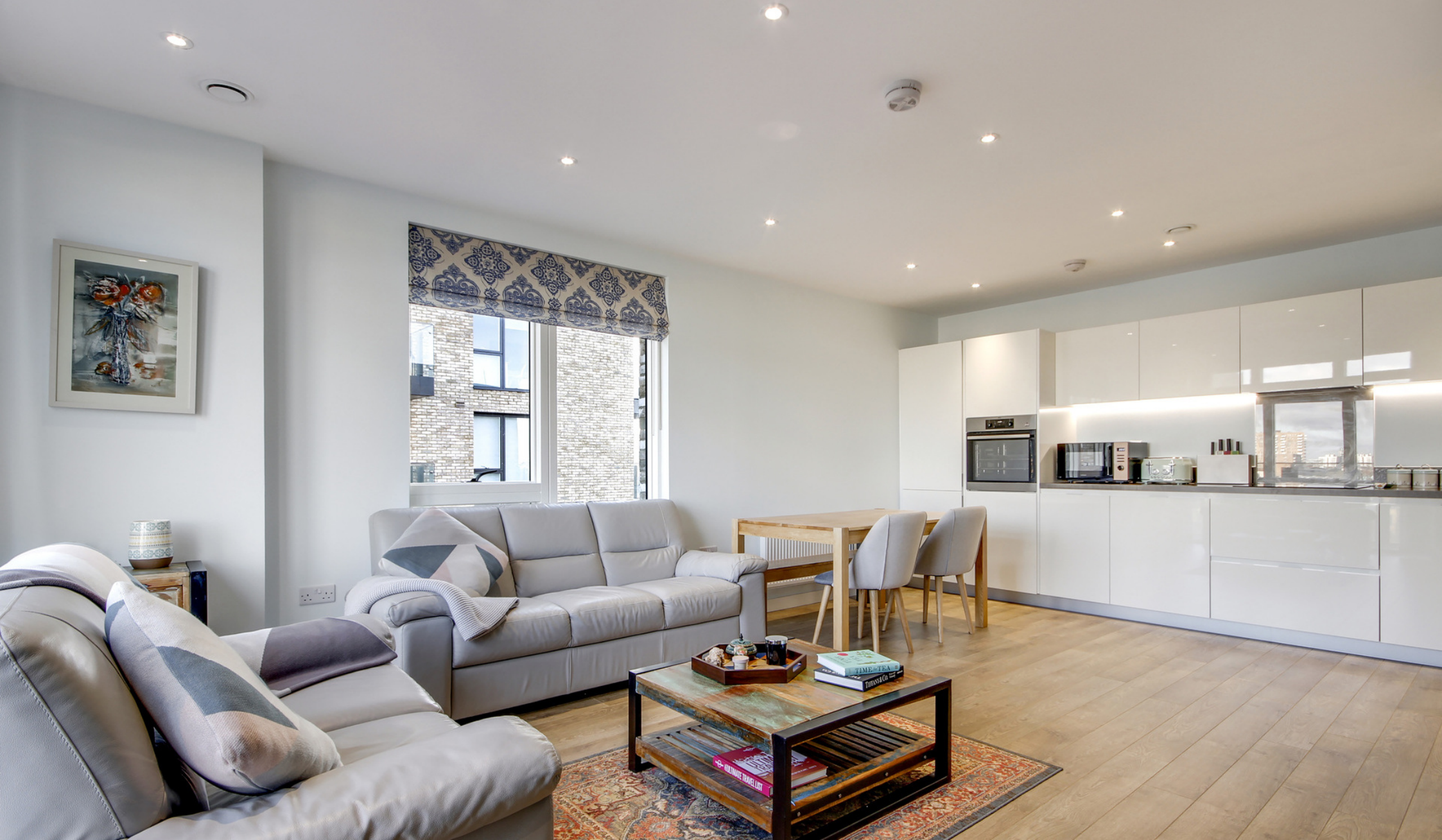
BANBURY POINT E14 2 bedroom apartment