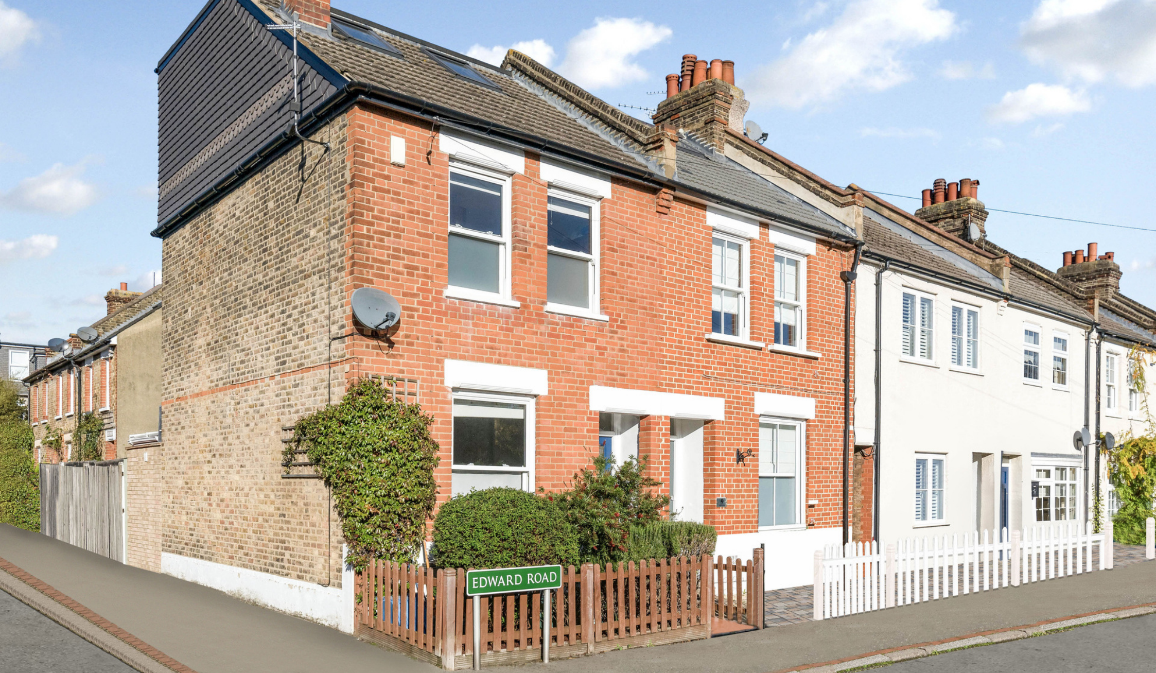
EDWARD ROAD BR7 3 bedroom terraced house