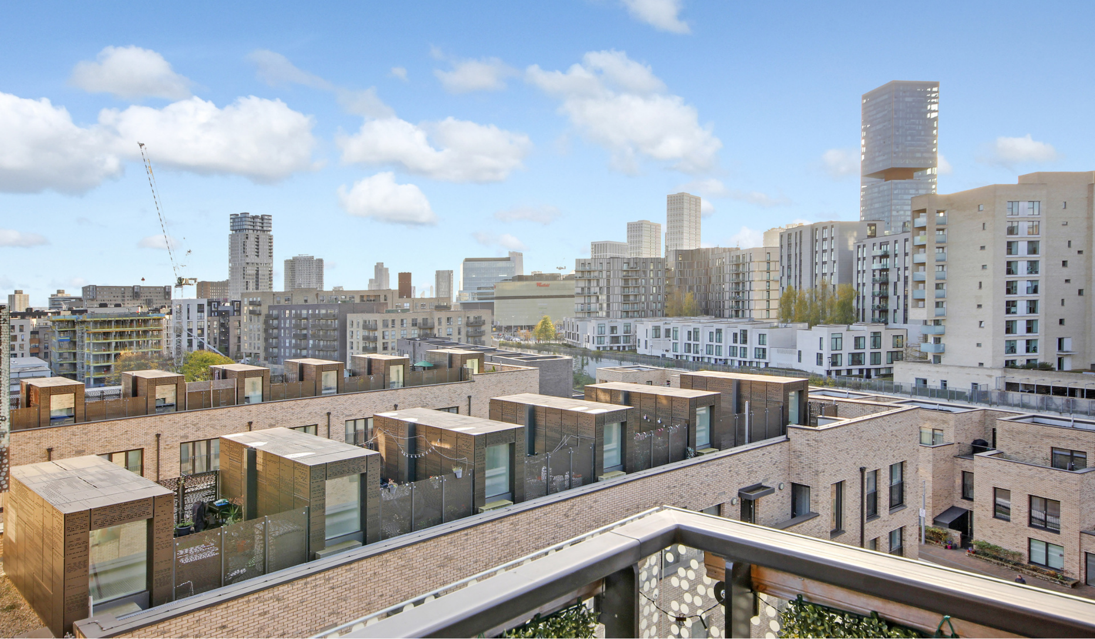
SENTINEL BUILDING E15 2 bedroom apartment