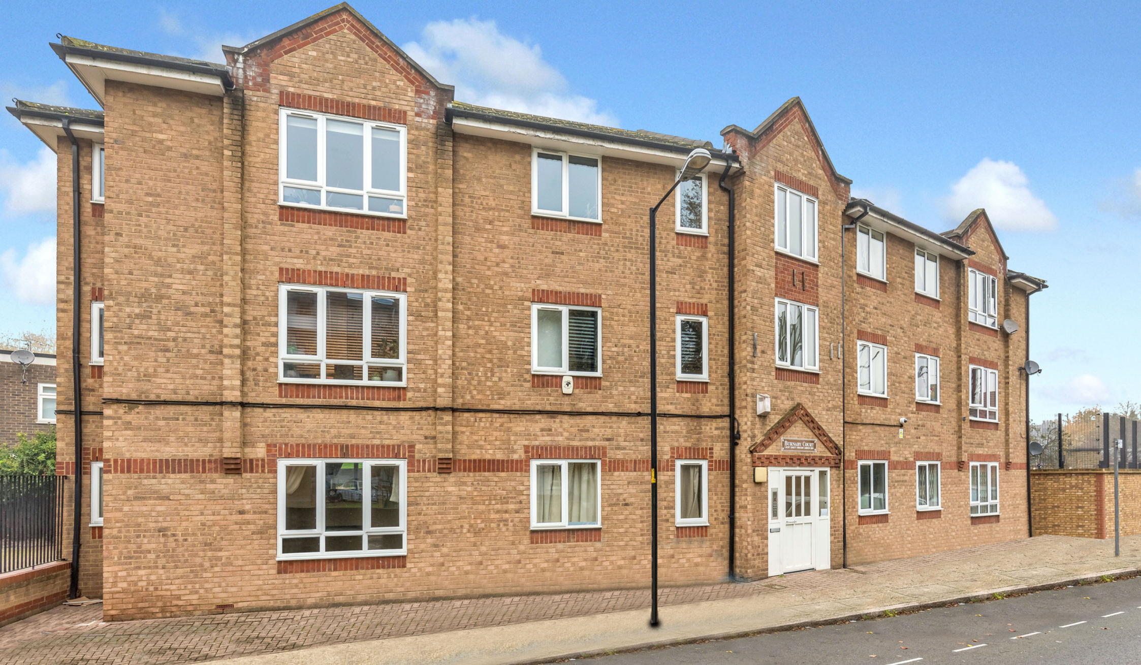
BURNABY COURT SE16 1 bedroom apartment