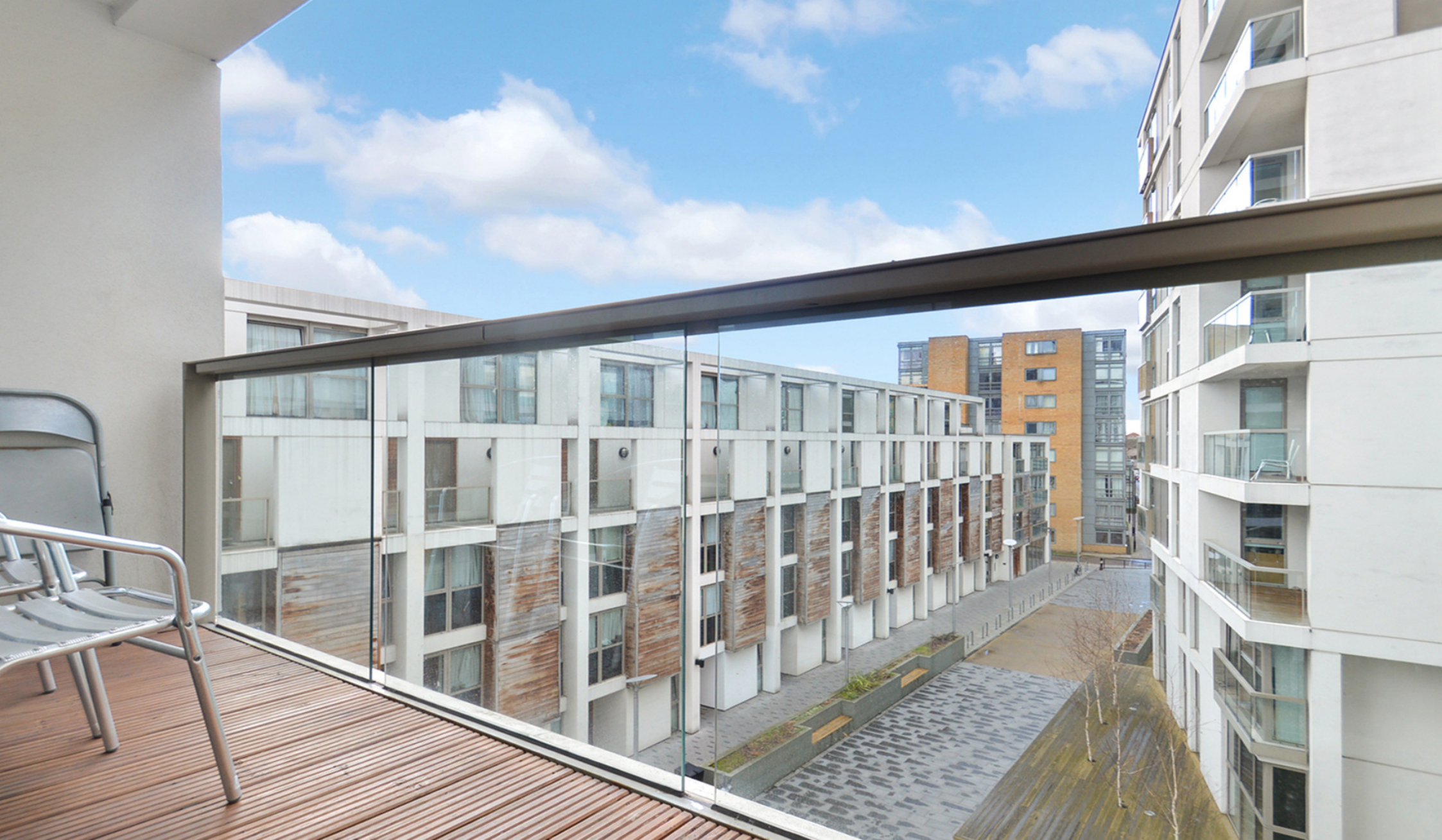
DENISON HOUSE E14 3 bedroom apartment